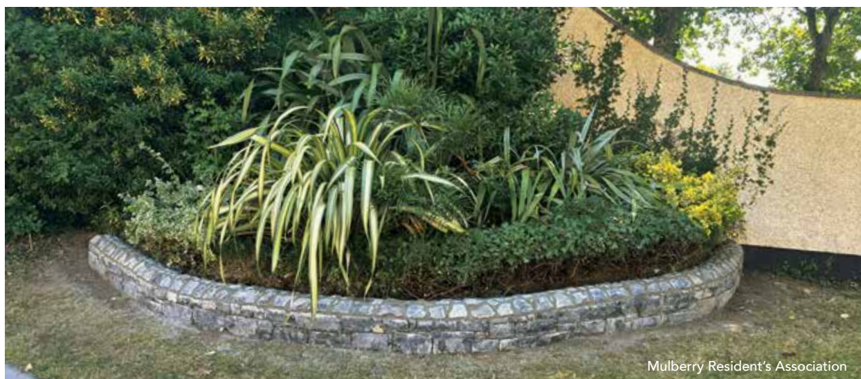
Mulberry Resident's Association