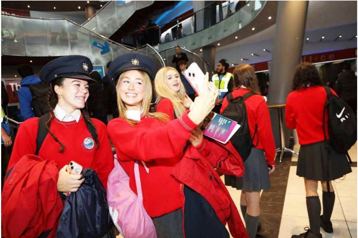
The Fingal TY Xplore Your Future Expo attracted over 2,500 students from schools across Fingal, offering interactive career and education/training signposting from more than 70 exhibitors.

In November 2025 Fingal County Council hosted the inaugural Fingal Skills Summit in The Riasc Centre, Kinsealy in collaboration with Dublin Regional Skills Forum, Fingal Skillnet, Dublin College FET, Fingal LEO, Department of Social Protection (Intreo) and DCU, providing employers with practical guidance on recruitment, upskilling and availability of training supports and insights from industry experts from Aramex,