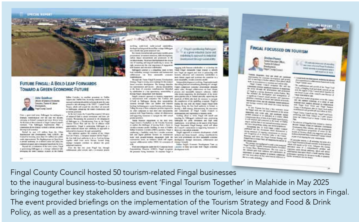
Fingal County Council hosted 50 tourism-related Fingal businesses to the inaugural business-to-business event ‘Fingal Tourism Together’ in Malahide in May 2025 bringing together key stakeholders and businesses in the tourism, leisure and food sectors in Fingal. The event provided briefings on the implementation of the Tourism Strategy and Food & Drink Policy, as well as a presentation by award-winning travel writer Nicola Brady.