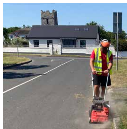
Portrane Village Renewal Group