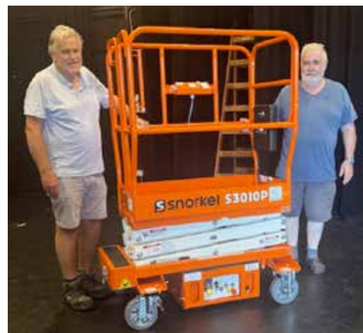
Rush Dramatic Society Millbank

A full list of successful applicants can be found here: https://assets.gov.ie/static/documents/Fingal_LEP_06_2025.pdf