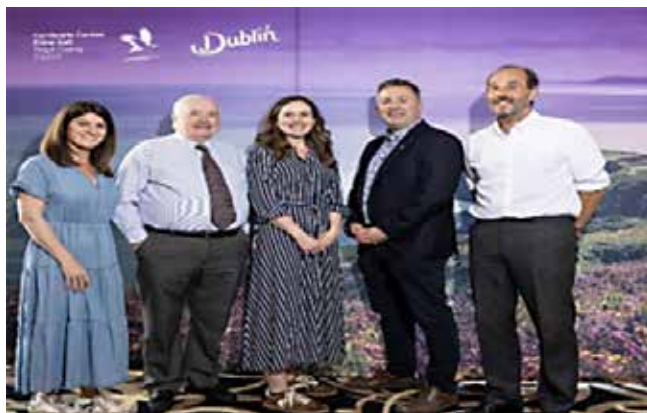
Supported by Fáilte Ireland and Tourism Ireland, the Council joined with South Dublin County Council and Dublin City Council to promote Dublin as part of the Fáilte Ireland ‘Winter in Dublin’ campaign and the new brand ‘Ireland Home of Halloween’ at Irishfest, Milwaukee, Wisconsin. Irishfest is the largest Irish festival in the USA and the world’s largest celebration of Irish culture and music in the world attracting over 130,000 visitors over 4 days.

Fingal was one of seven destinations awarded funding under Fáilte Ireland’s new Home of Halloween Destination Development Pilot Scheme for 2025–2028, receiving funding of €100,000 annually to craft immersive, culturally rooted Halloween experiences. This investment is part of a broader €1.5 million initiative to position Ireland as the global home of Halloween, generate regional economic growth, and attract tens of thousands of visitors.