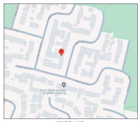
LOCATION MAP NTS