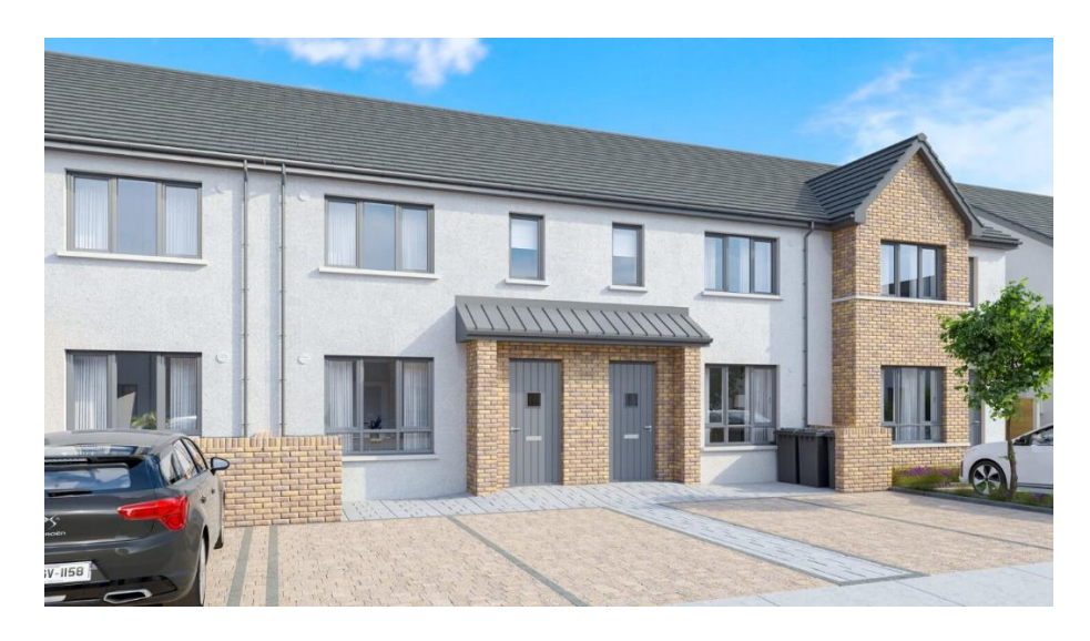
Frequently Asked Questions