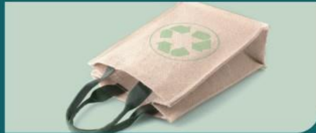
SHOPPING & RECYCLING

Comhairle Contae Fhine Gall Fingal County Council