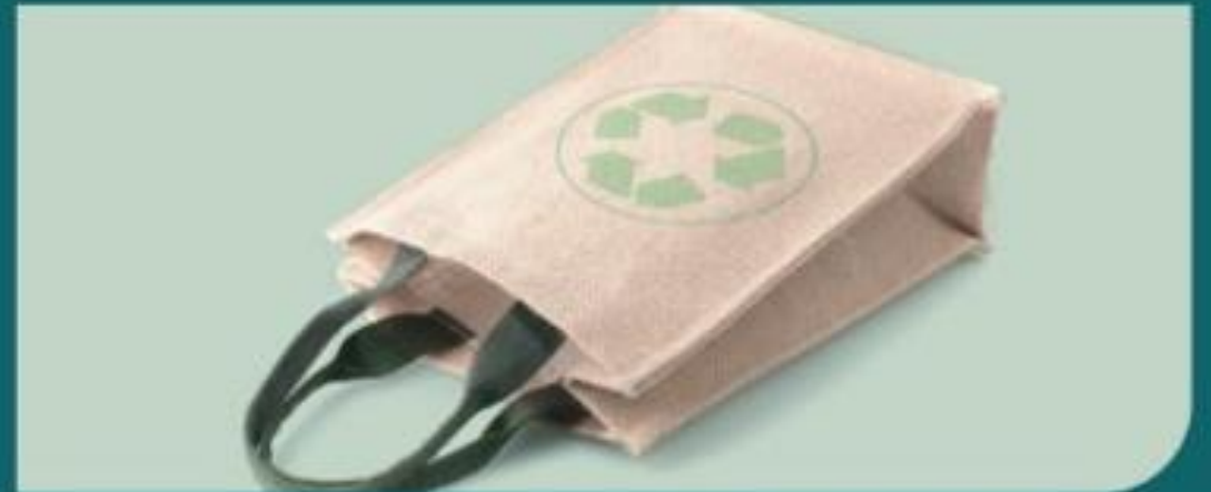
SHOPPING & RECYCLING