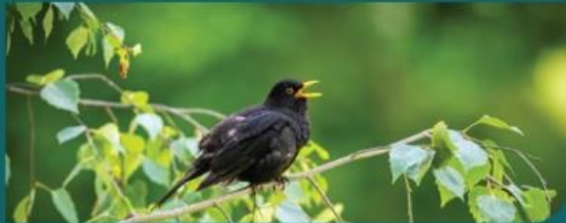
LOCAL CLIMATE & ENVIRONMENTAL ACTION