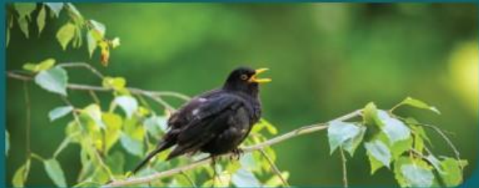
LOCAL CLIMATE & ENVIRONMENTAL ACTION