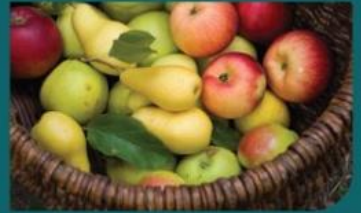
FOOD & WASTE