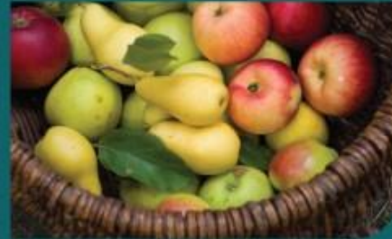
FOOD & WASTE