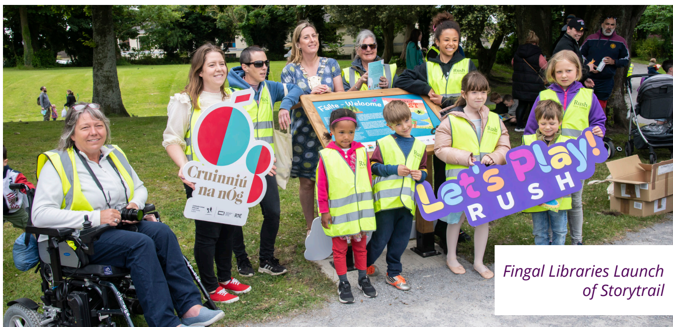
Fingal Libraries Launch of Storytrail