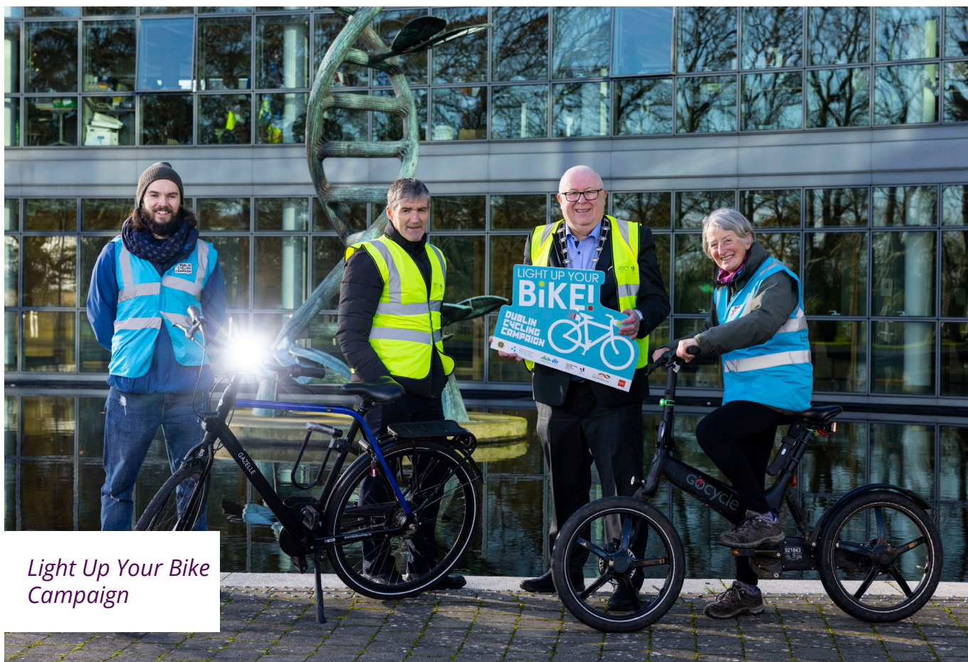
Light Up Your Bike Campaign