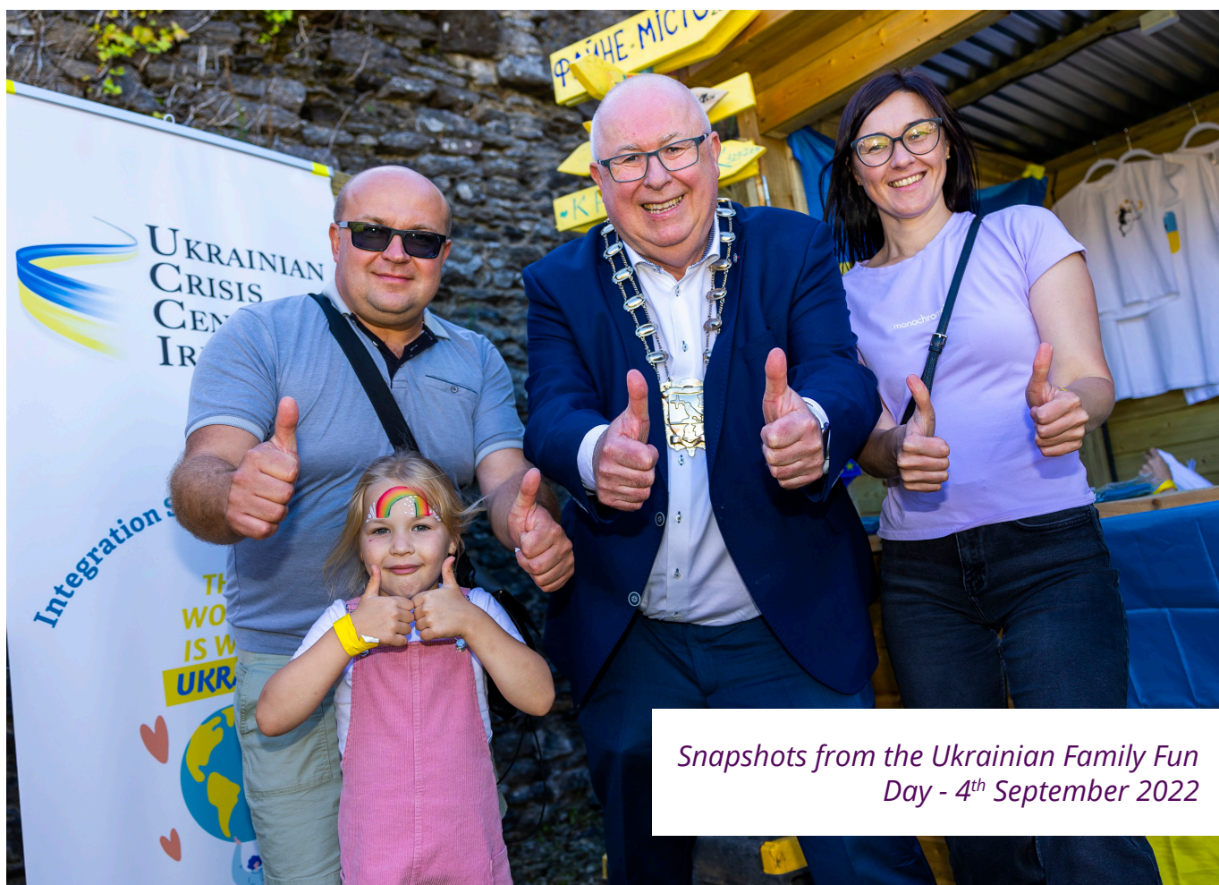
Snapshots from the Ukrainian Family Fun Day - 4 th September 2022