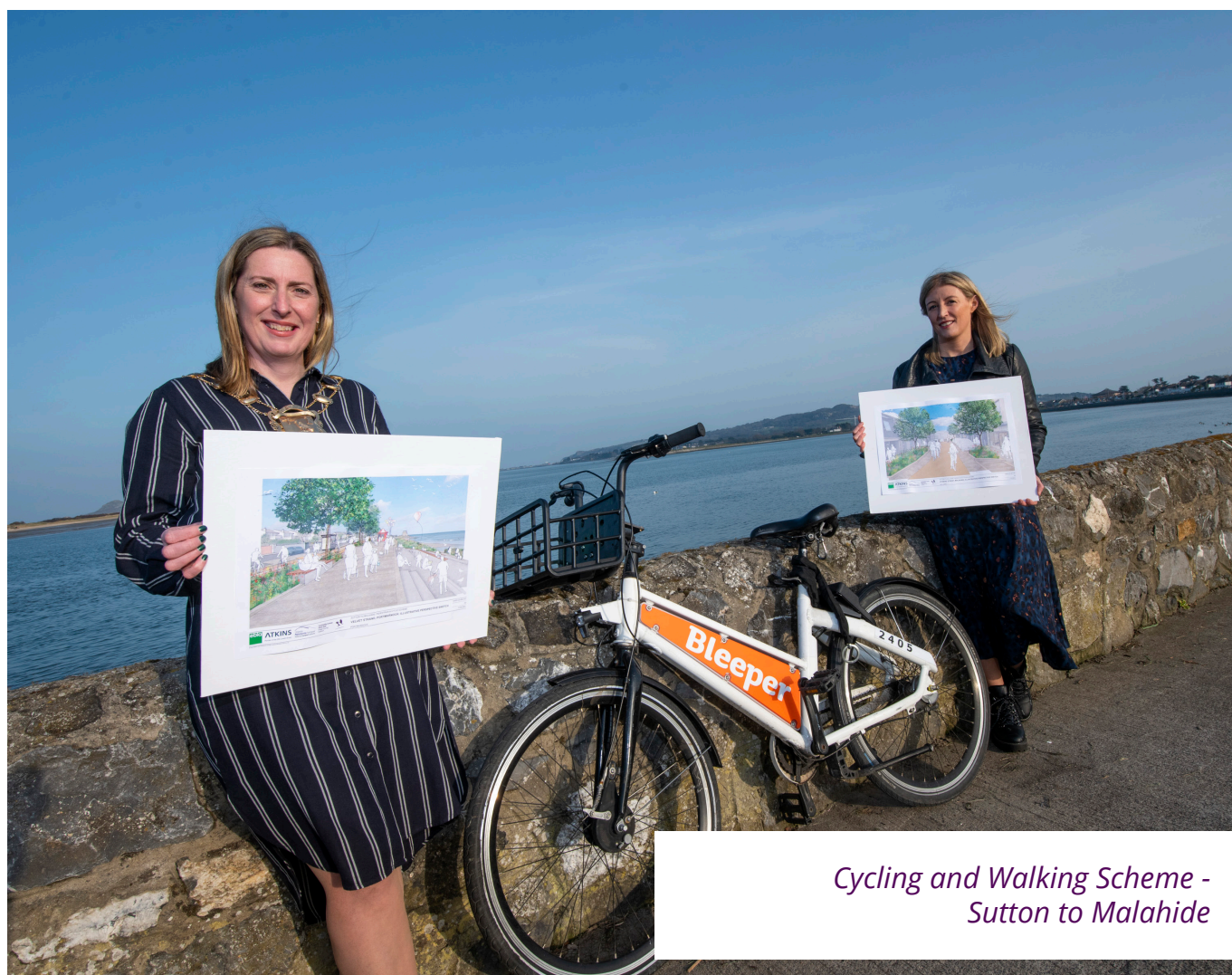
Cycling and Walking Scheme - Sutton to Malahide