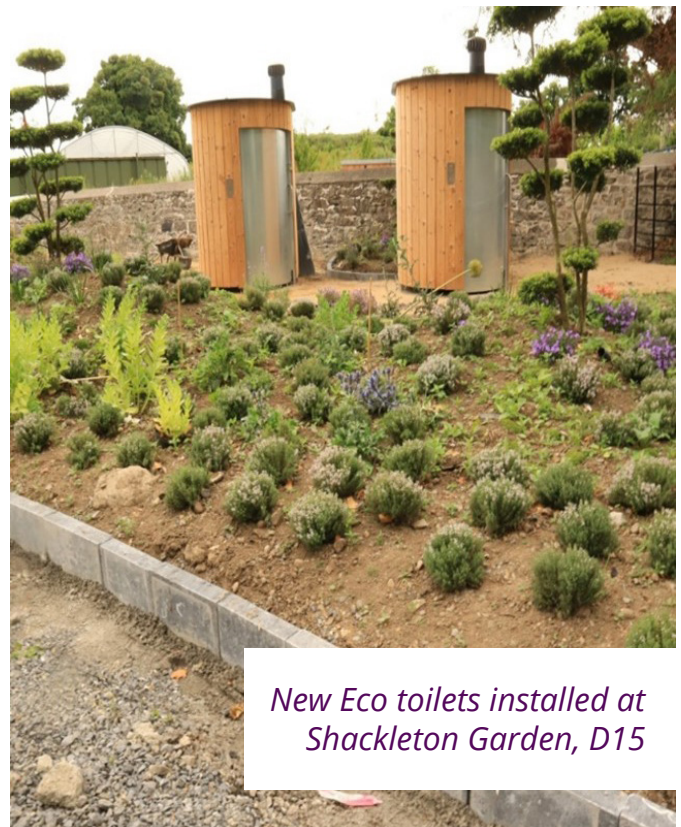
New Eco toilets installed at Shackleton Garden, D15