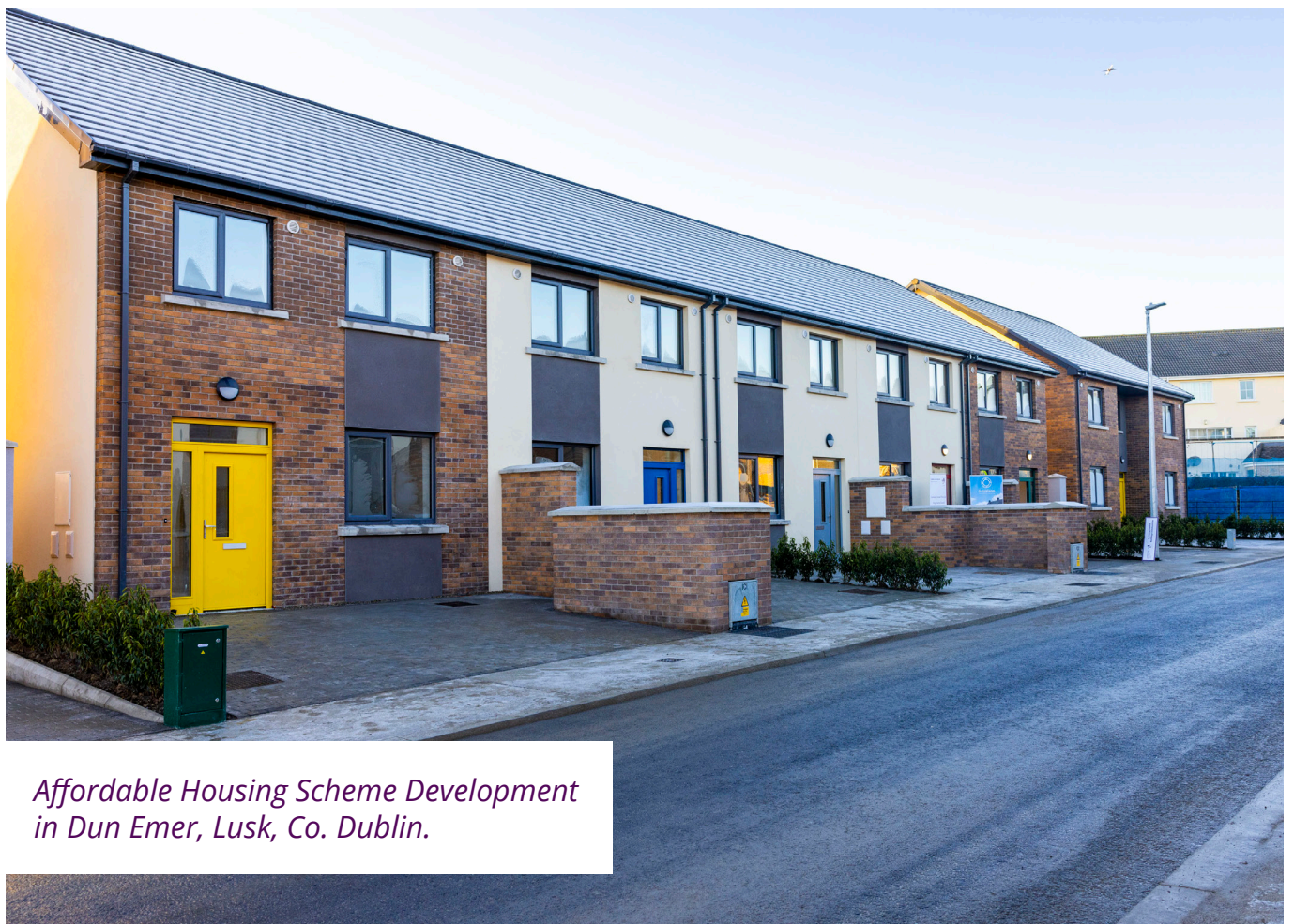
Affordable Housing Scheme Development in Dun Emer, Lusk, Co. Dublin.