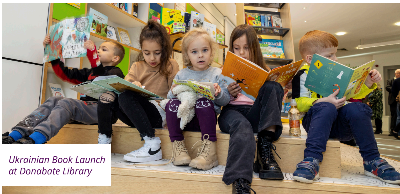
Ukrainian Book Launch at Donabate Library