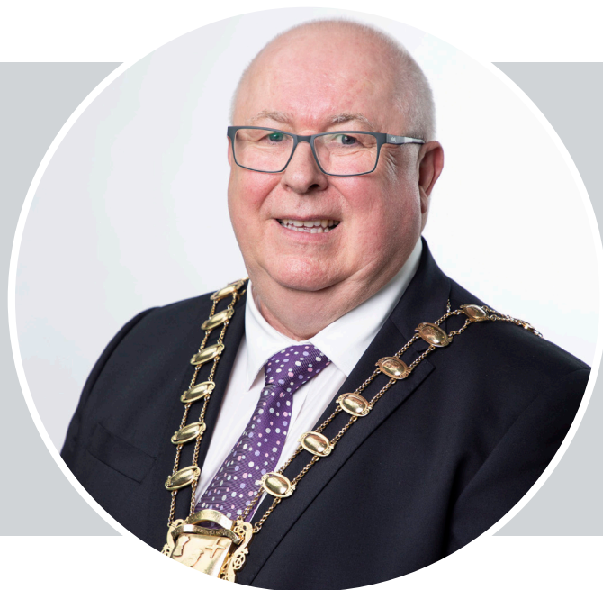
Mayor Howard Mahony June-December 2022