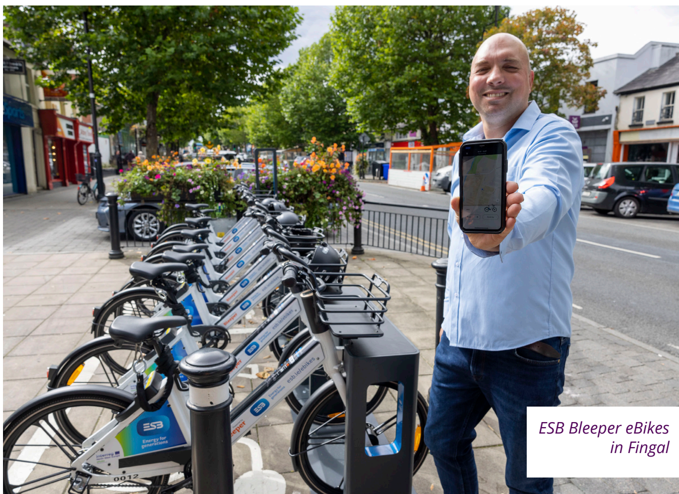
ESB Blepper eBikes in Fingal