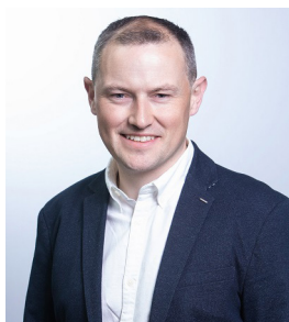
Ian Carey Green Party Comhaontas Glas