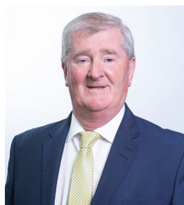
Tom Kitt Fianna Fáil