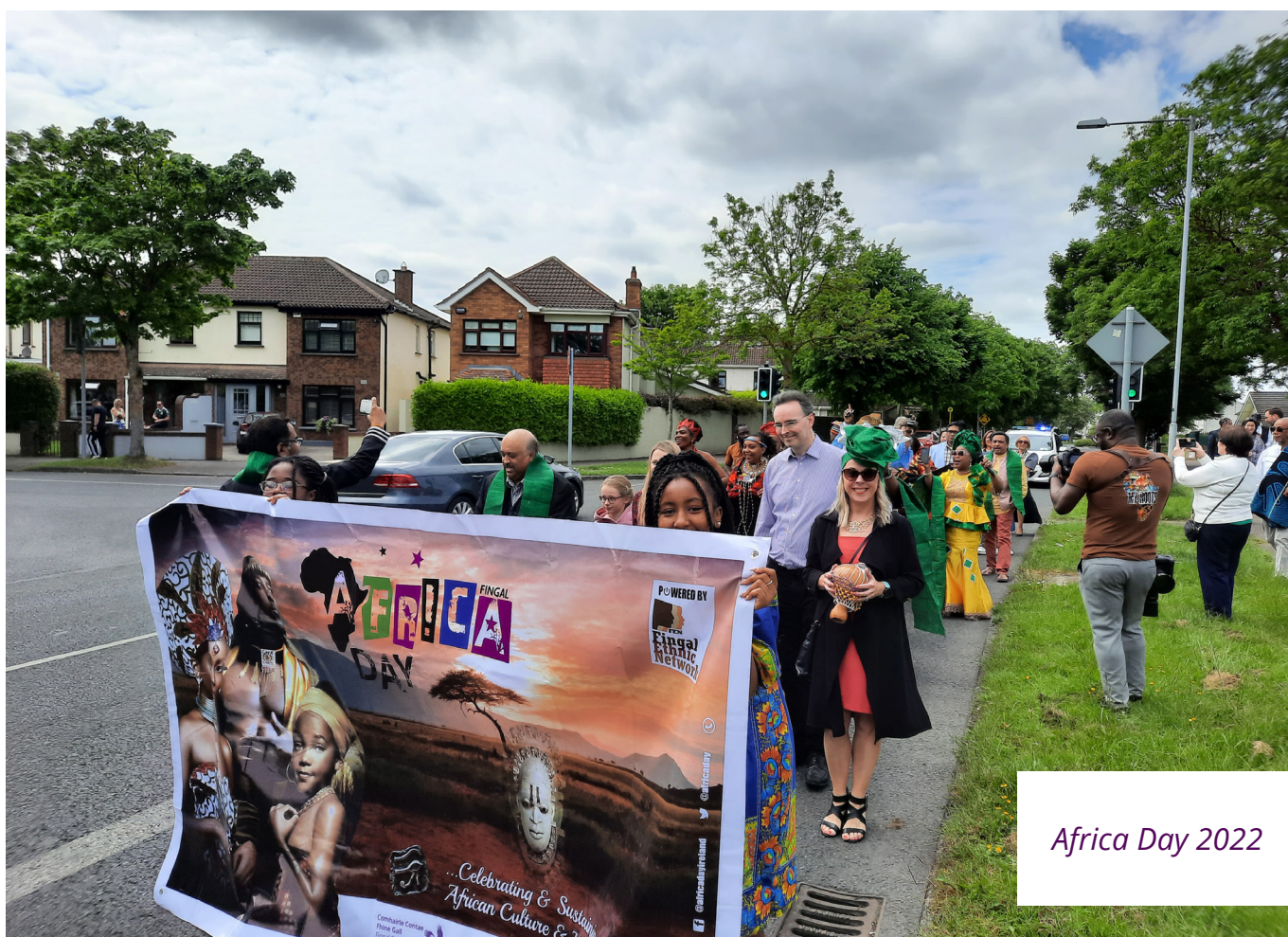
Africa Day 2022