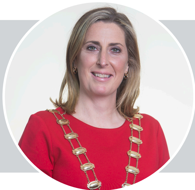
Mayor Seána Ó Rodaigh January-June 2022