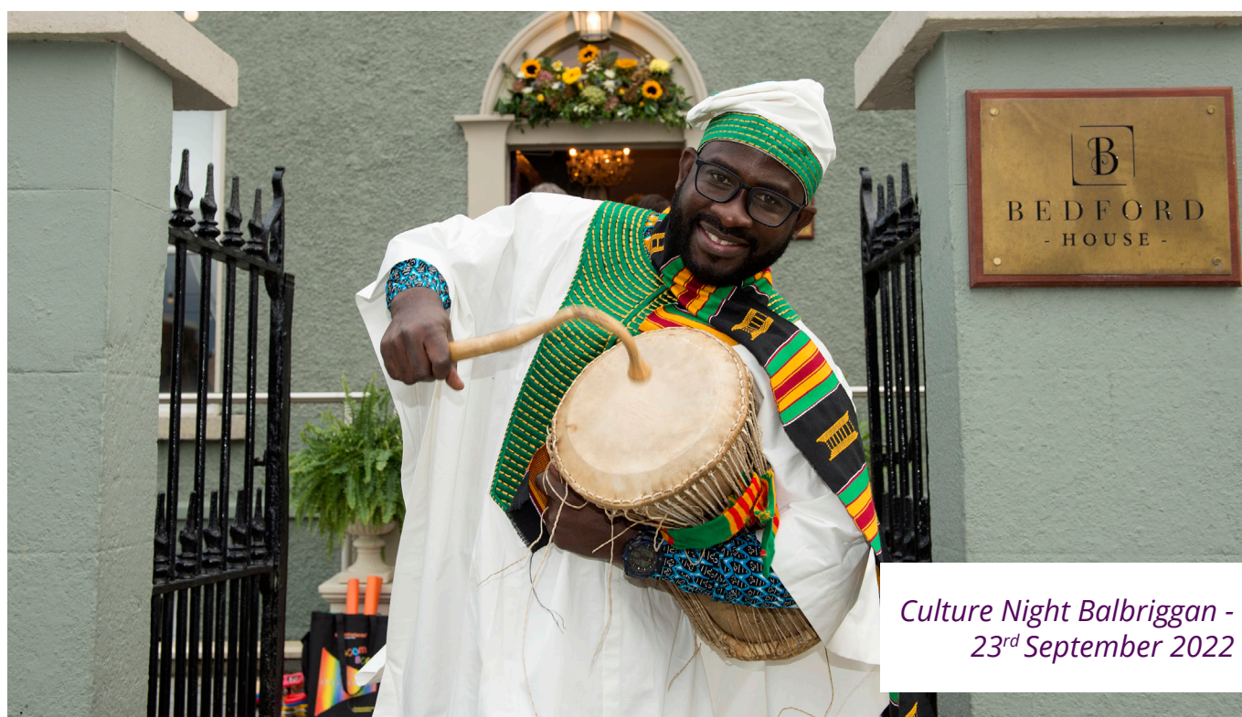
Culture Night Balbriggan - 23 rd September 2022