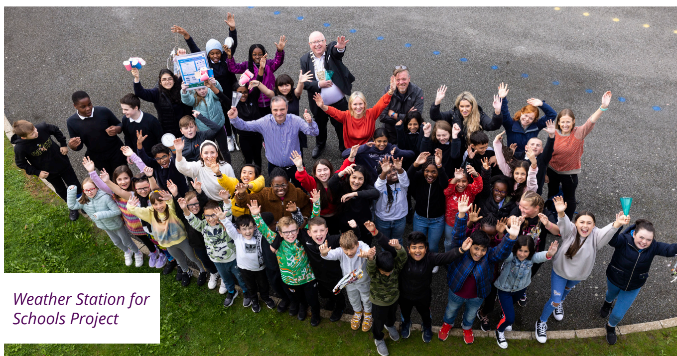
Weather Station for Schools Project