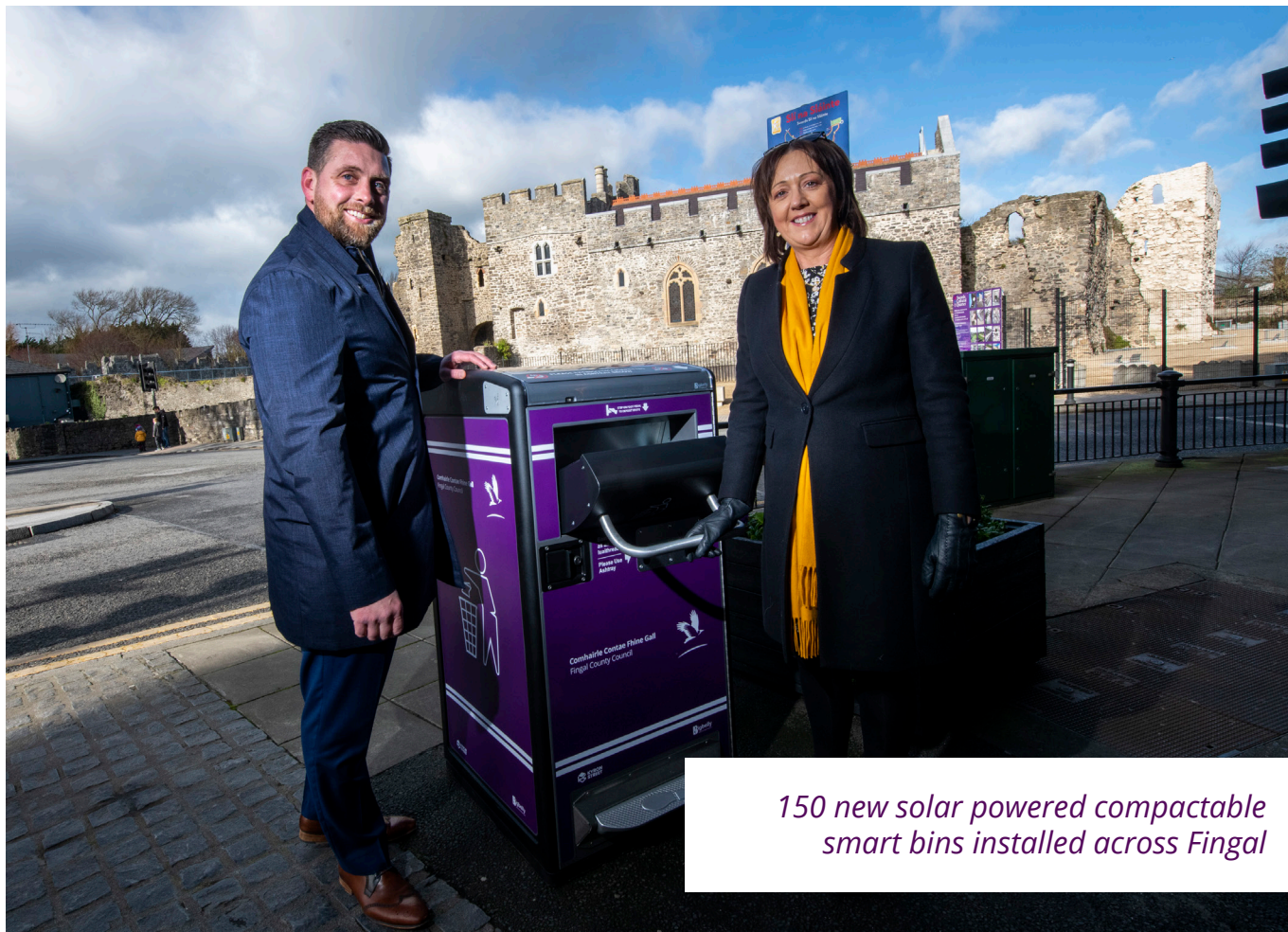
150 new solar powered compactable smart bins installed across Fingal