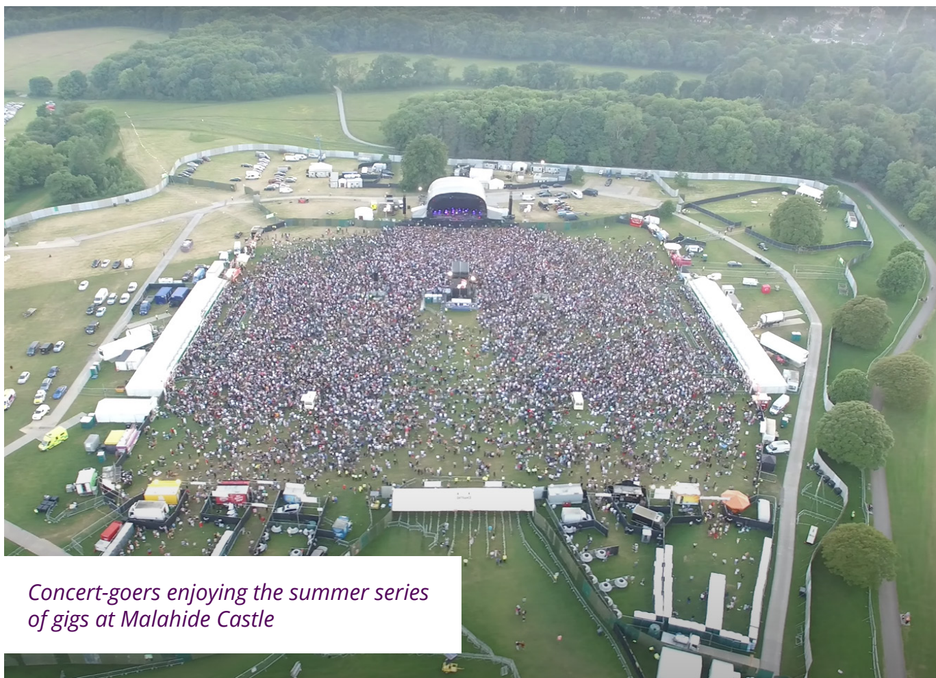
Concert-goers enjoying the summer series of gigs at Malahide Castle