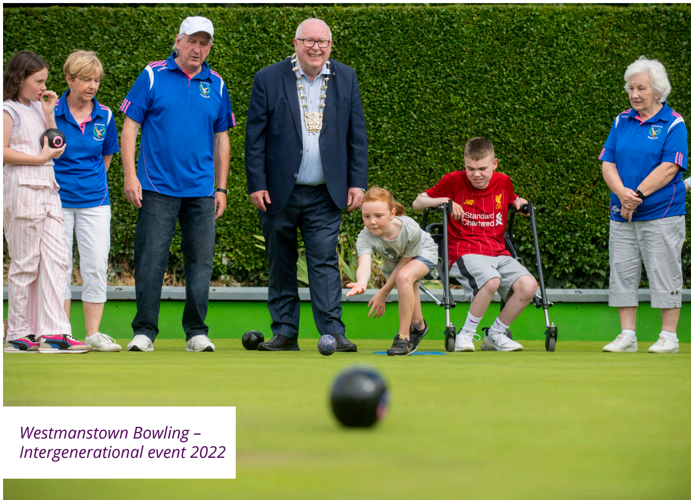
Westmanstown Bowling – Intergenerational event 2022