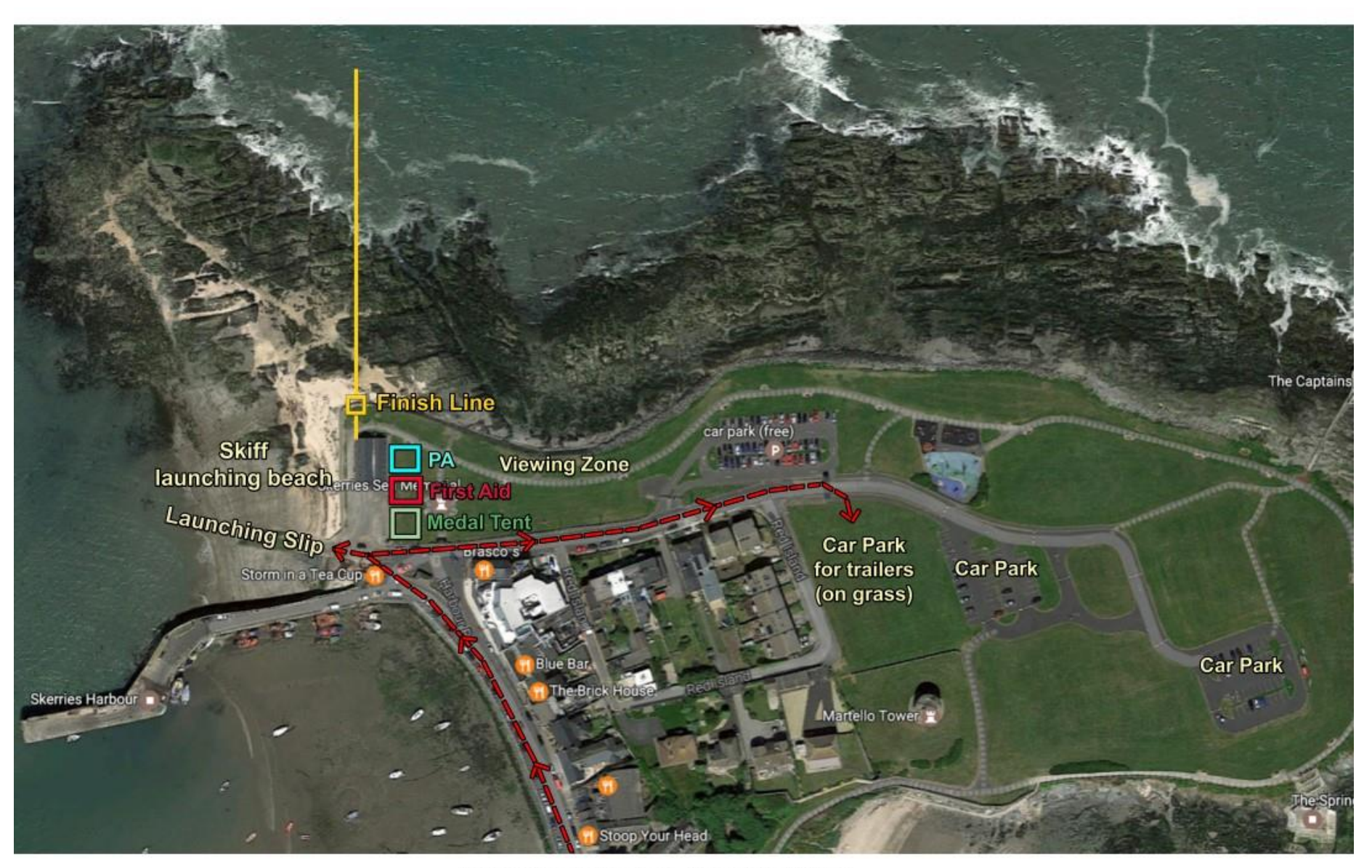
Skerries Rowing Regatta 2019 Organisational Layout