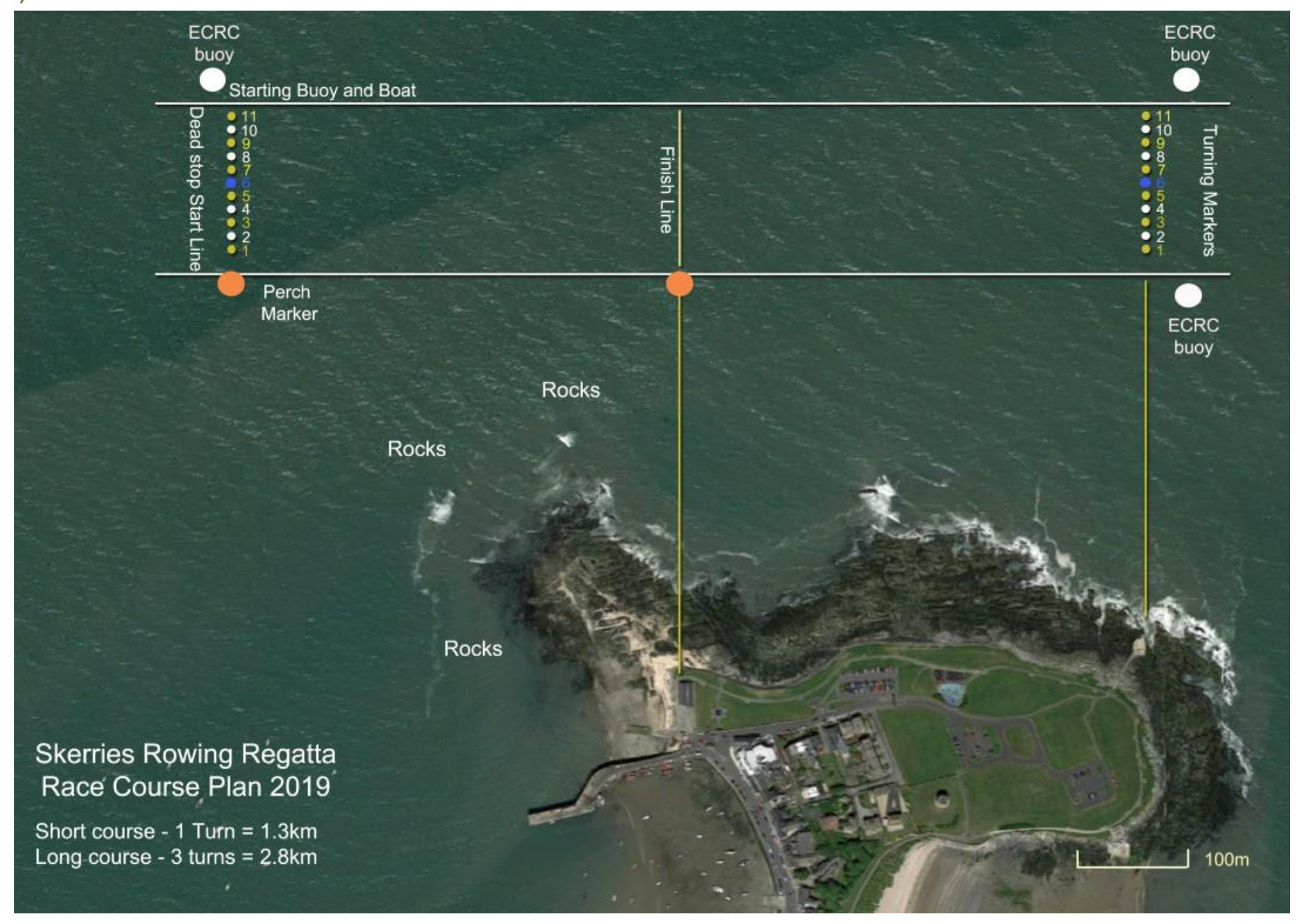
Page 21 of 21