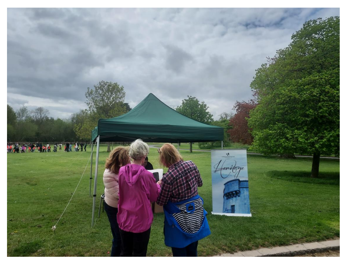
Heritage Plan information stand in Newbridge House, 6 May 2023

horse. It could be a document with the names and locations of the stud farms and training yards..."