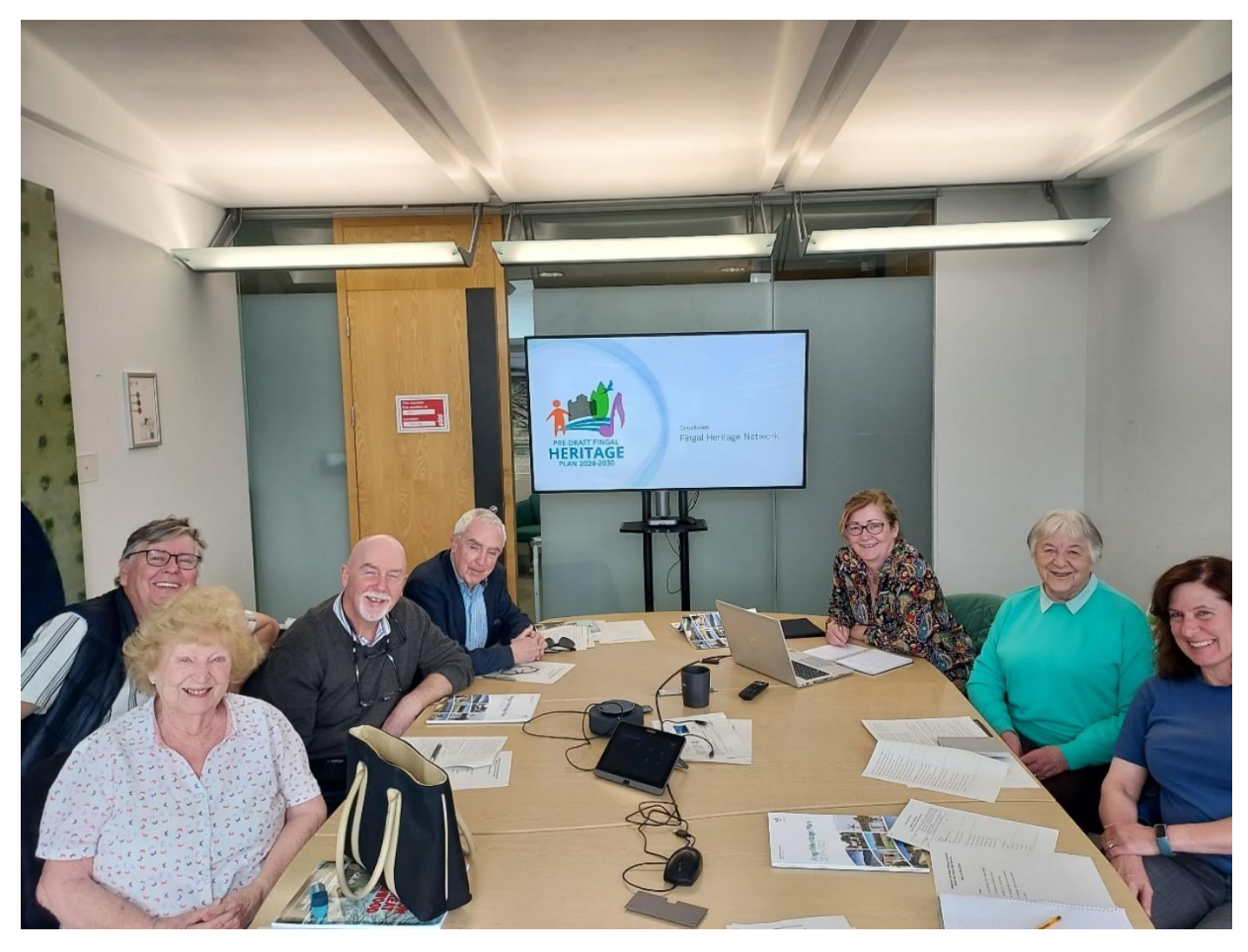
Fingal Heritage Network

There is strong interest among the Heritage Network in engaging young people and new communities and the groups in the network are keen to share ideas and models for how to do this. A pilot project is currently underway in schools in Skerries, involving children interviewing grandparents about when they grew-up and there is interest in replicating this initiative in other areas.