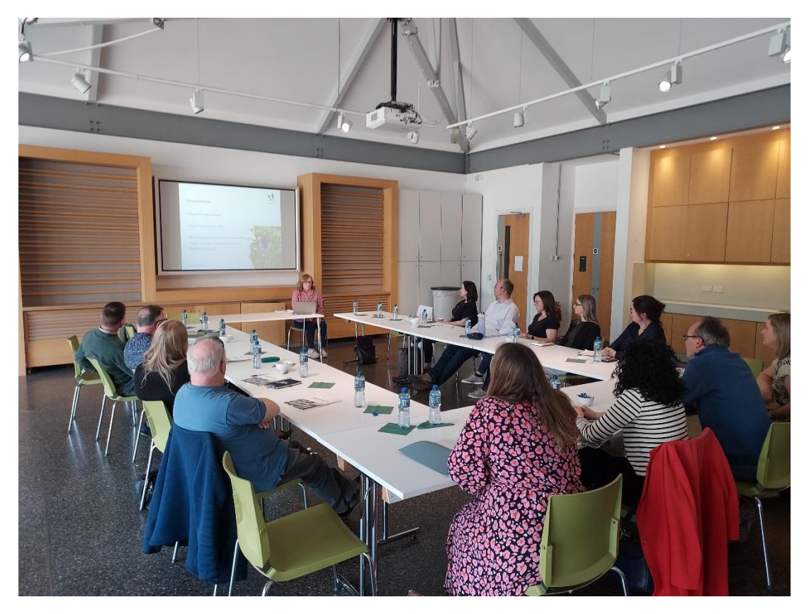
The Fingal Heritage Forum

A workshop with members of the Fingal Heritage Forum was held on 17 May 2023, in Malahide Castle to discuss themes and areas of focus for the Fingal Heritage Plan 2024-2029, which will demonstrate cognisance of National and EU legislation and alignment with best practice, while reflecting the themes in the Heritage Council strategy "Our Place in Time" .