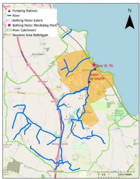
Map 1: Location and Extent of Front Strand, Balbriggan bathing water