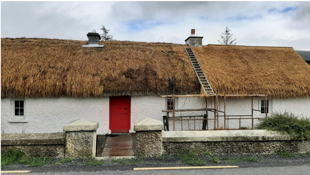
Thatched House, Galross, Shannon Harbour, Co Offaly – funded under BHIS 2021

Please note grant-approved works must meet all statutory requirements, including planning permission and all applications are subject to FOI. For a full list of terms and conditions, please consult the Built Heritage Investment Scheme Circular, available on all Local Authority websites.