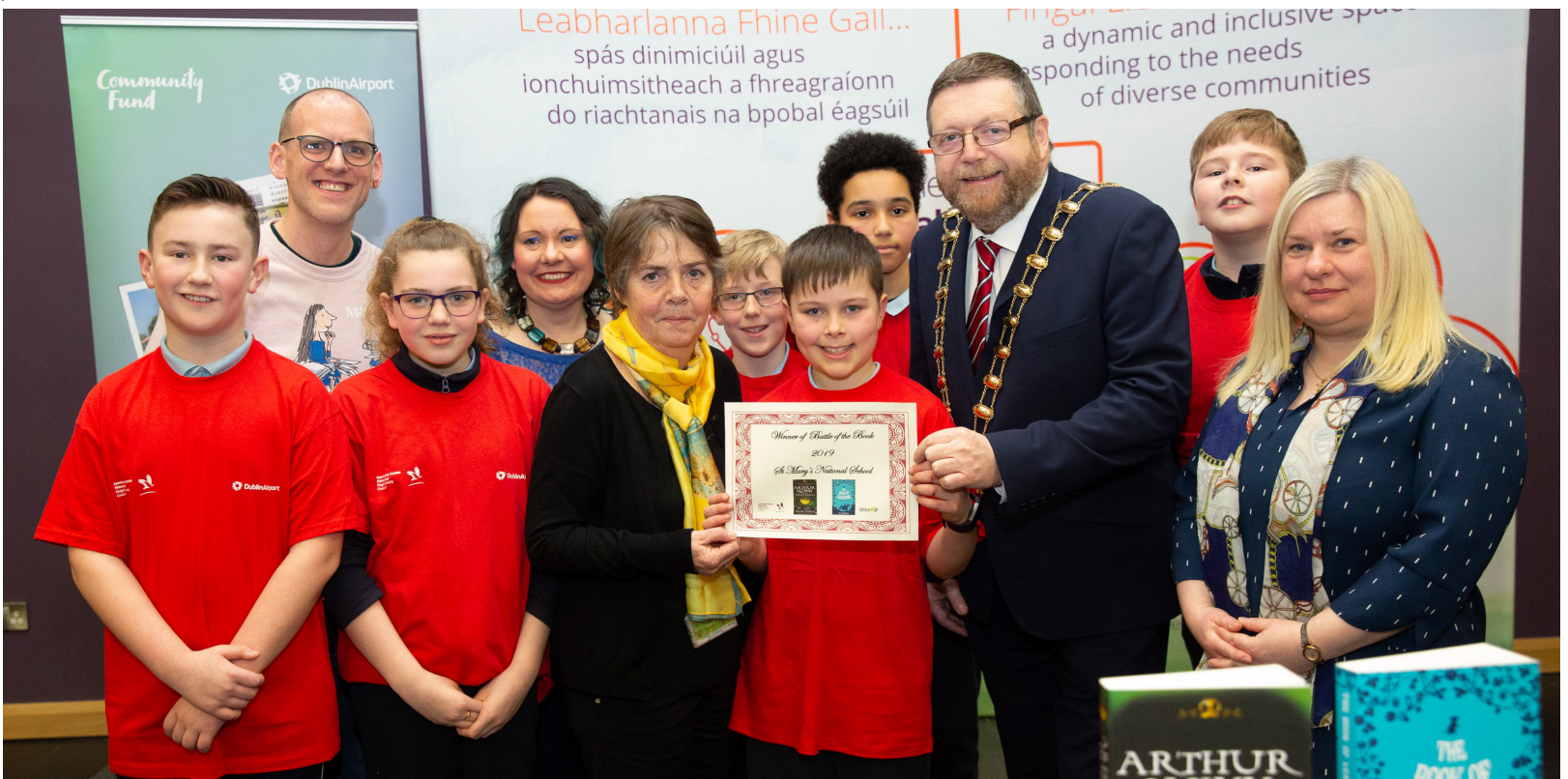
The final of the Battle of the Books was won by St Mary's NS in Garristown.