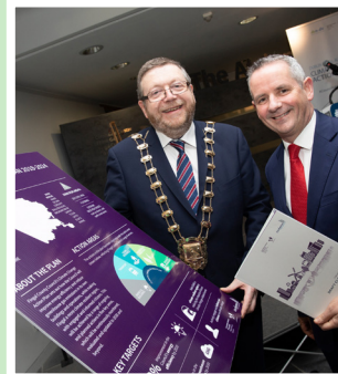
Fingal unveils Climate Change Action Plan - P12