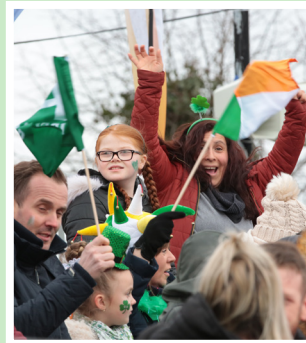
Fingal prepares for St Patrick's Day parades- P6