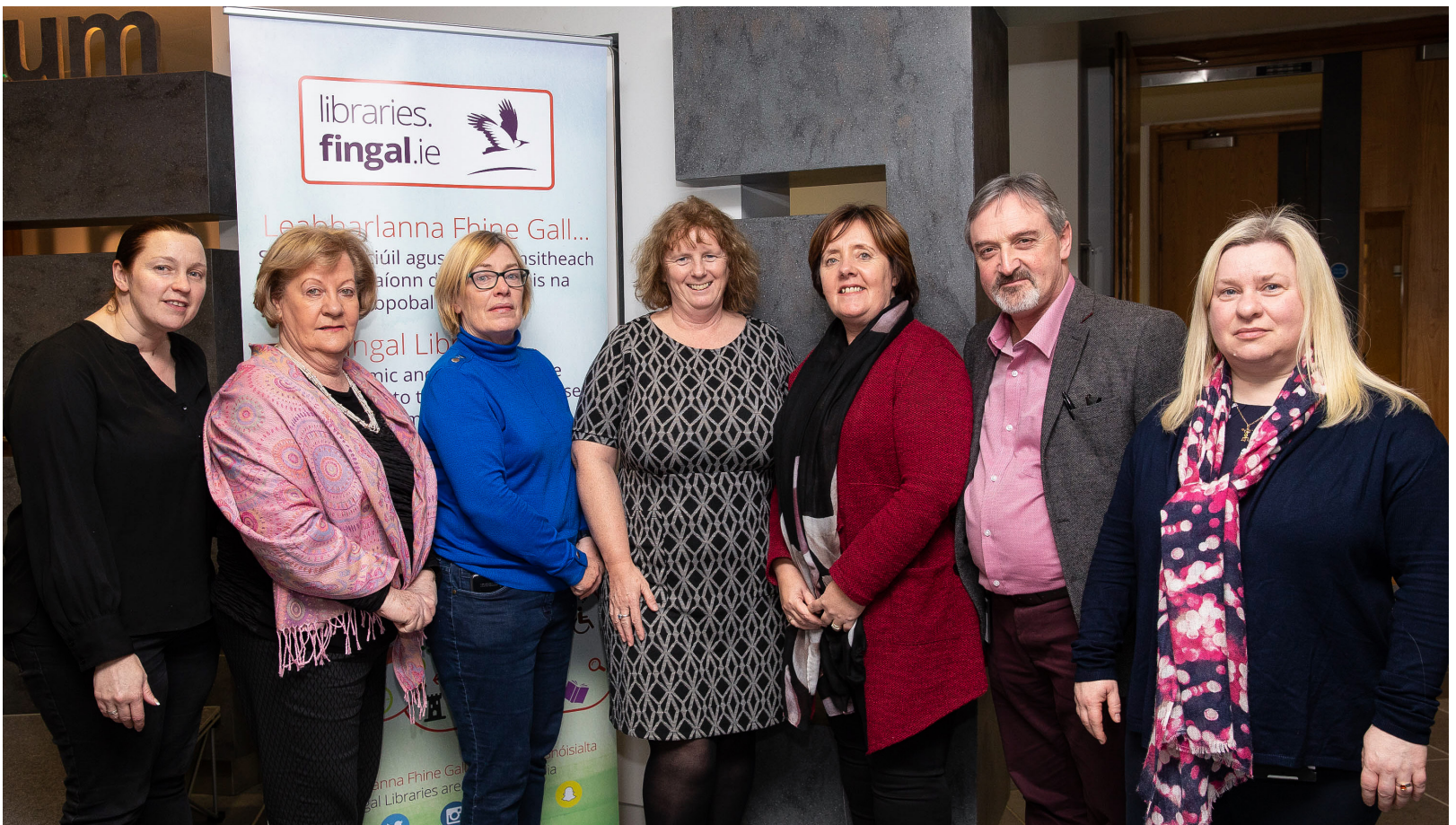
The meeting of the first Dáil in January 1919 was commemorated in the County Hall in Swords..