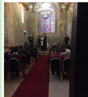
Swords Castle hosts first civil ceremony - P3