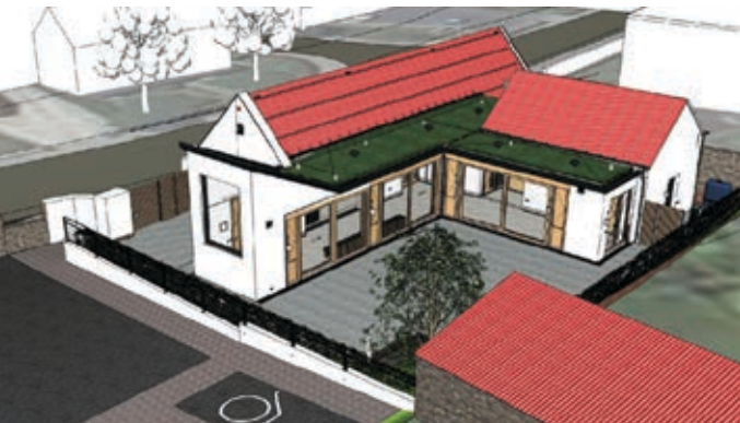
Katy Hunt Cottage Lusk - Before and after