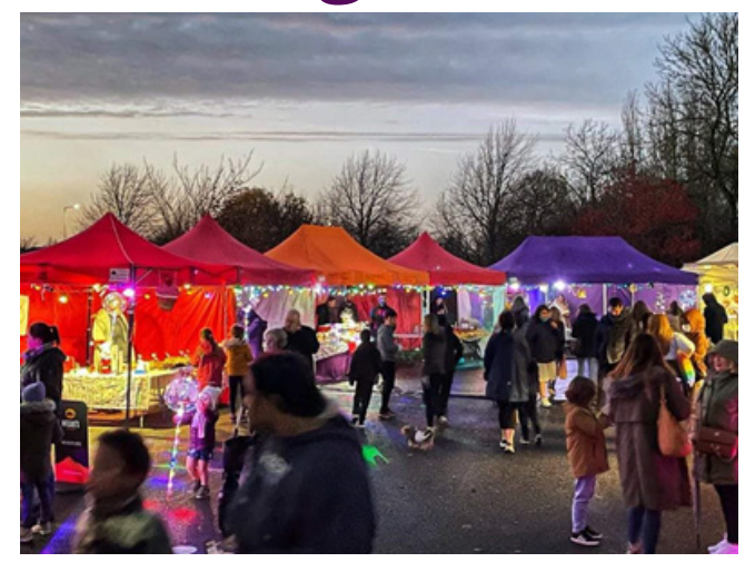
The Operations Department was delighted to welcome a Christmas Themed Market on a pilot basis to tie in with the Enchanted Forest in Millennium Park this month. The Market proved to be a big success which received positive feedback from the members of the public.