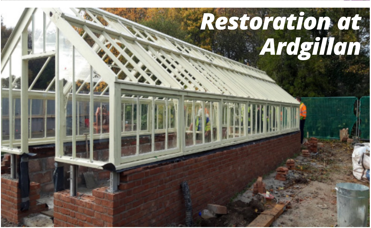
The glasshouse restoration project is starting to generate great interest from the public as the works become more visible. Planning & Strategic Infrastructure Department are leading on this project and are facilitated on site by Operations Department Staff and the team at Ardgillan Demesne.

The Fingal sites to retain Green Flag status in 2021 are: Ardgillan Demesne, Malahide Demesne, Millennium Park in Blanchardstown, Newbridge House and Farm, Santry Demesne and St Catherine's Park. Santry Community Garden and The Rock Garden in Swords also received a Community Award, the second year in a row it has managed to achieve the accolade.