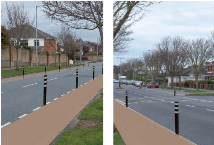
Pictured above: Mock up of proposed bollards with reflective markings and epoxy resin lane coatings. This mock up is similar to measures to be installed in this scheme.