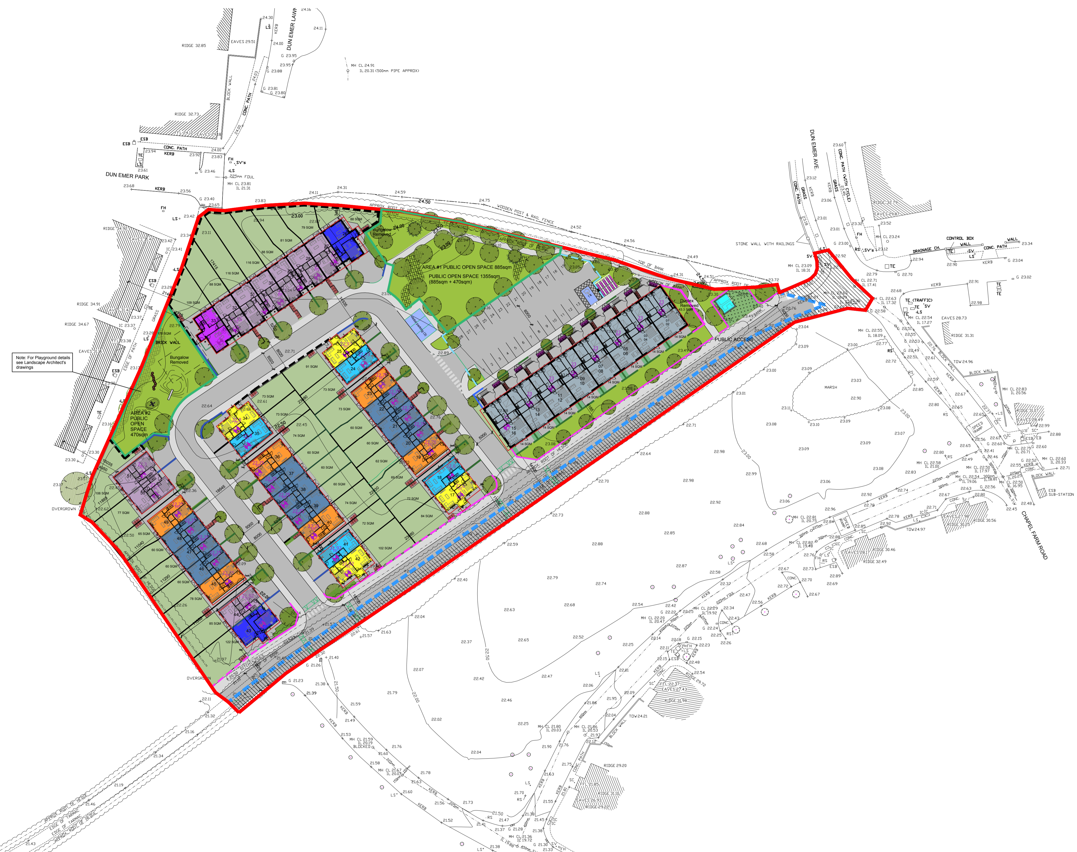
PROPOSED SITE PLAN SCALE 1:500 @ A1