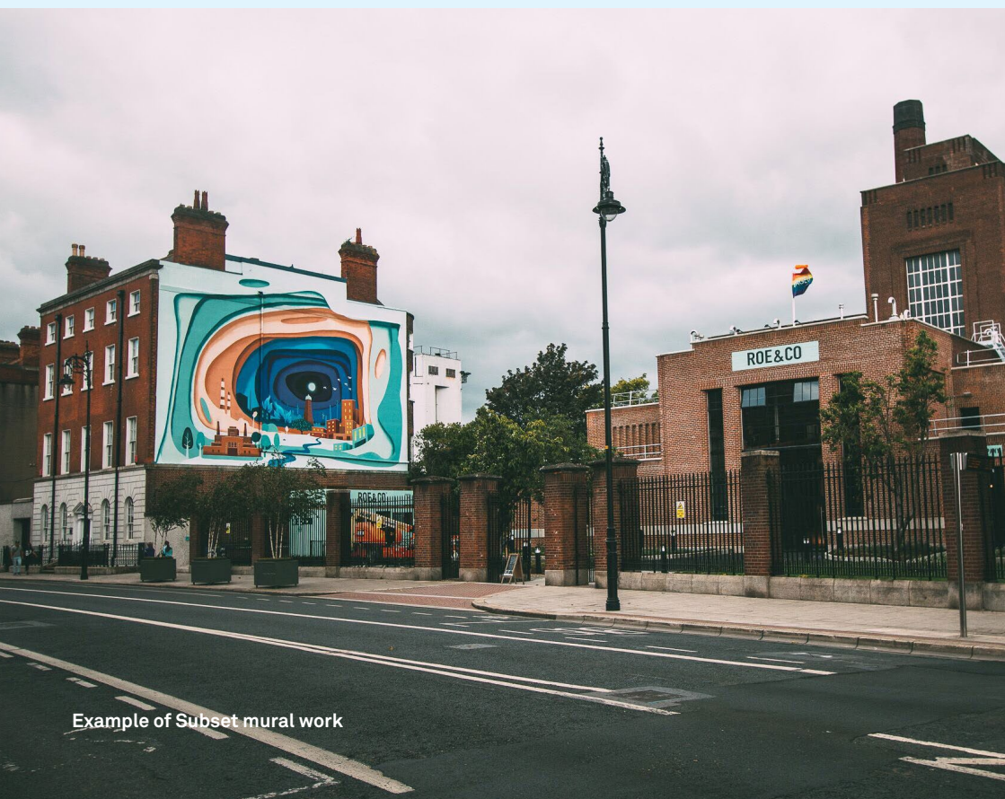
Example of Subset mural work

Well known artist collective Subset will have completed a special commission commemorating the Sack of Balbriggan and remembers 100 years since that historic event where the Black & Tans ransacked the town and killed innocent people. This new mural located on the gable wall of the Central Lounge on Bridge Street, while acknowledging this tragic moment in the town's history, celebrates its hopeful future. The mural was commissioned by Fingal Arts Office in close partnership with and on behalf of the Sack of Balbriggan Commemorations Committee whose input has ensured that the work reflects on the towns past and its bright future. The artists will commence the work from the 14th of September 2020. If you are passing Balbriggan's main street check out this new mural work on Bridge Street which will be completed on Culture Night!