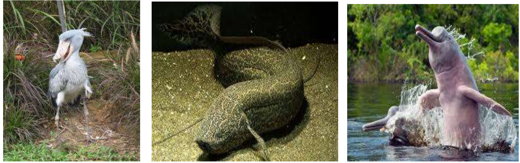
7 Fun Facts