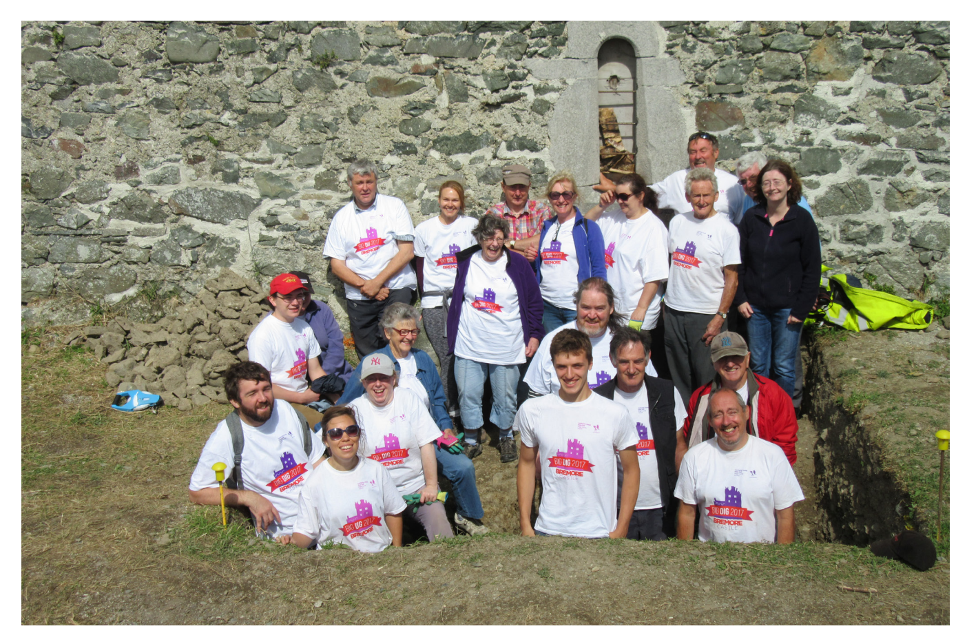
Bremore Big Dig 2017 participants fill Trench 3