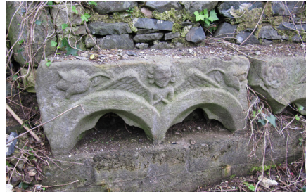
Decorated double headed window