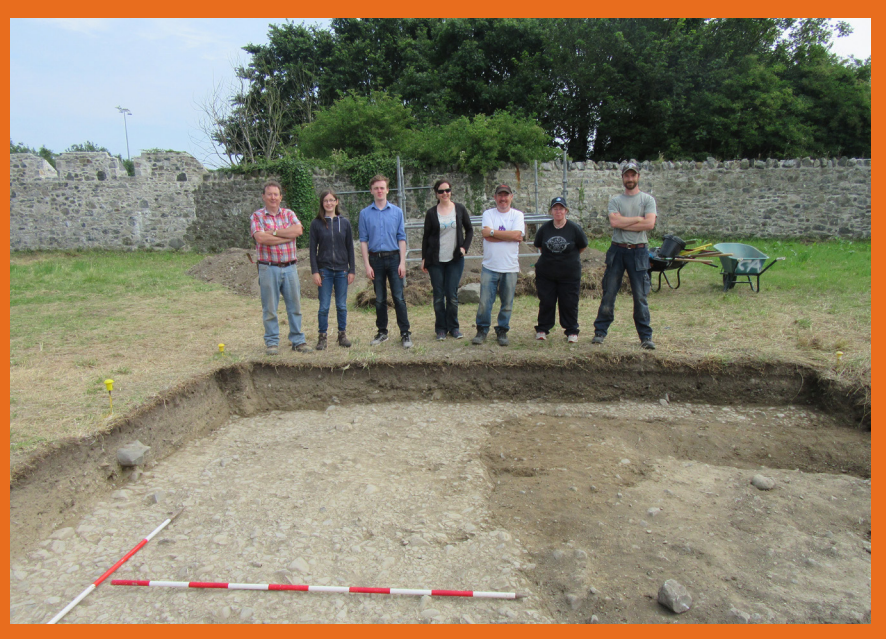
Bremore Big Dig team uncovering the yard surface and modern disturbance