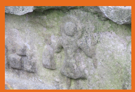
Saint with bee skep, depicted on 1689 lintel