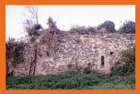
South wall of the fortified house prior to reconstruction.