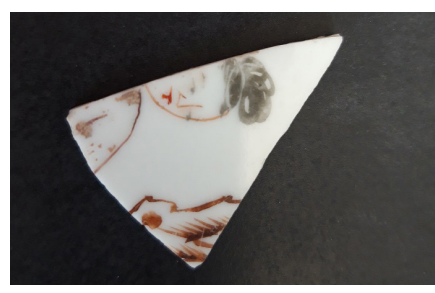
Chinese Porcelain, mid-17th-mid 18th century