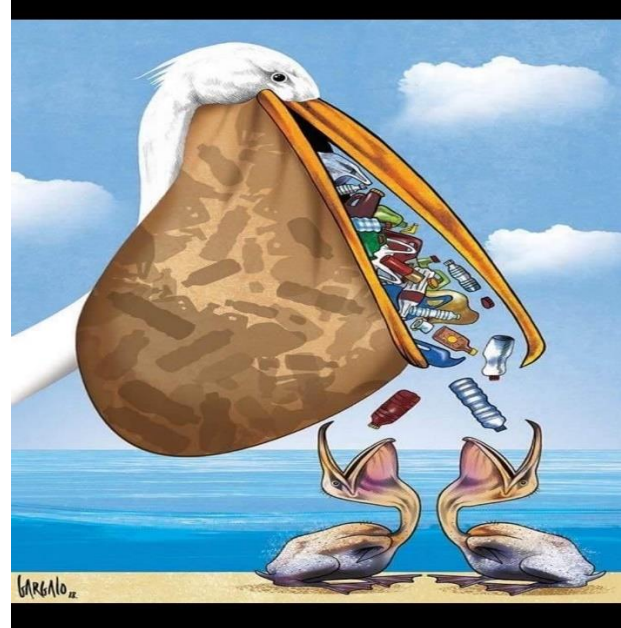
Our wildlife is been affected by the plastic in the oceans.