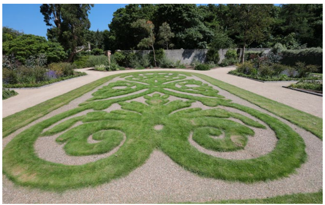
Malahide Castle Gardens