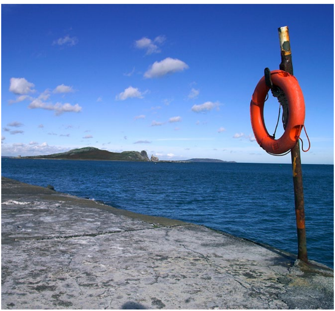
Natura Islands, from Howth

The annual progress reports will be presented to the Heritage Forum and submitted to the Planning and Development Strategic Policy Committee (SPC) and to the Arts, Culture, Heritage and Community SPC of Fingal County Council.