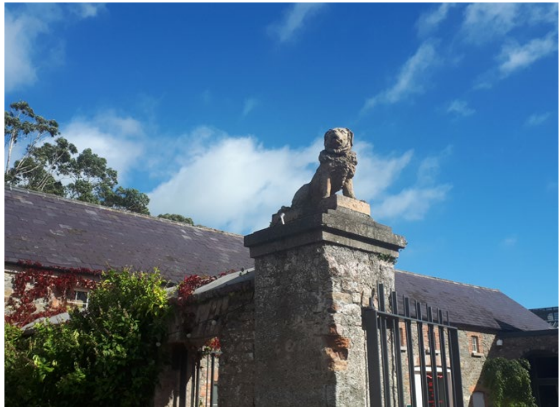
Malahide Castle Courtyard

Conservation Plans have been completed for Newbridge House and Bremore Castle, together with a Masterplan for the Swords Cultural Quarter. Conservation works have been undertaken at several sites including Swords Castle, Newbridge House, Drumanagh Promontory Fort, Stella's Castle and the church in St. Catherine's Park. Assessment of archaeological monuments across Fingal has been completed as part of the Field Monuments Advisor programme together with the development of maintenance regimes for archaeological sites and monuments located in open space.