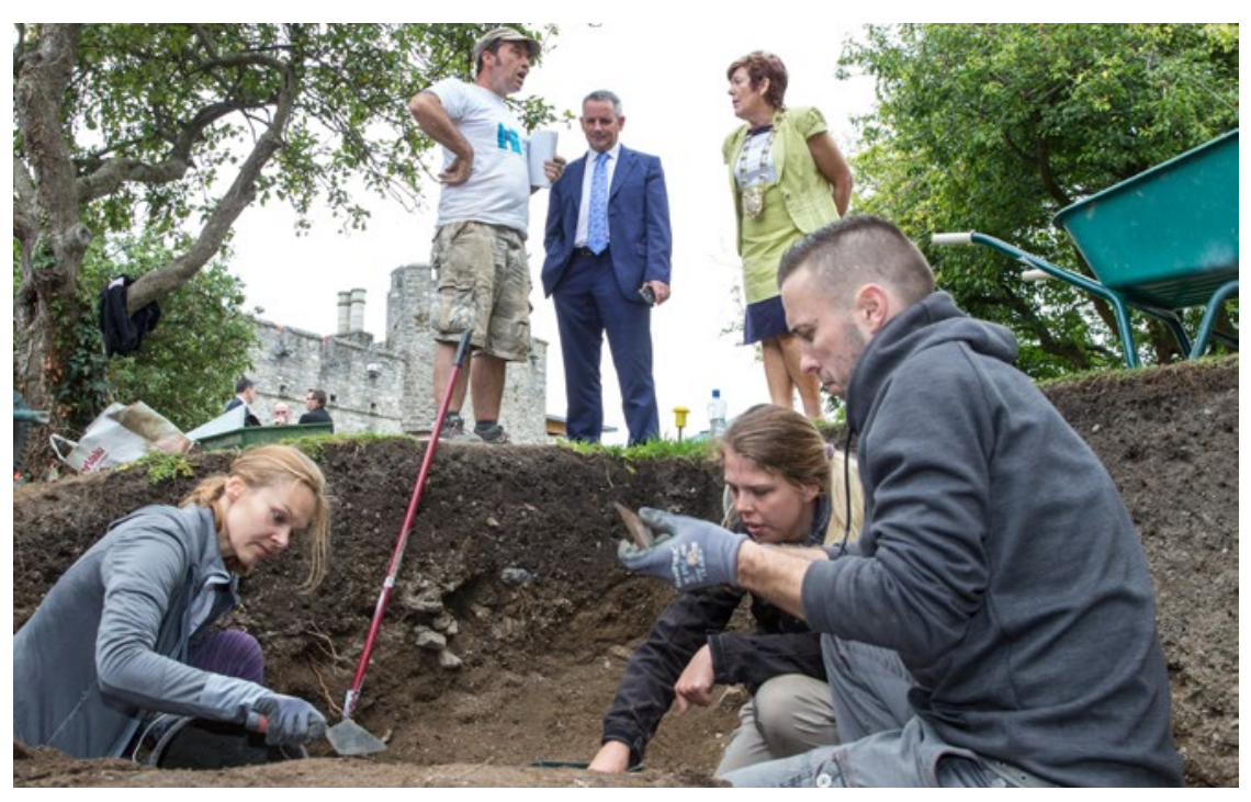
Swords Castle Digging History

27. Support the Fingal Heritage Forum in performing its functions. Review membership of the Forum in 2018 ensuring increased community, tourism and natural heritage representation.