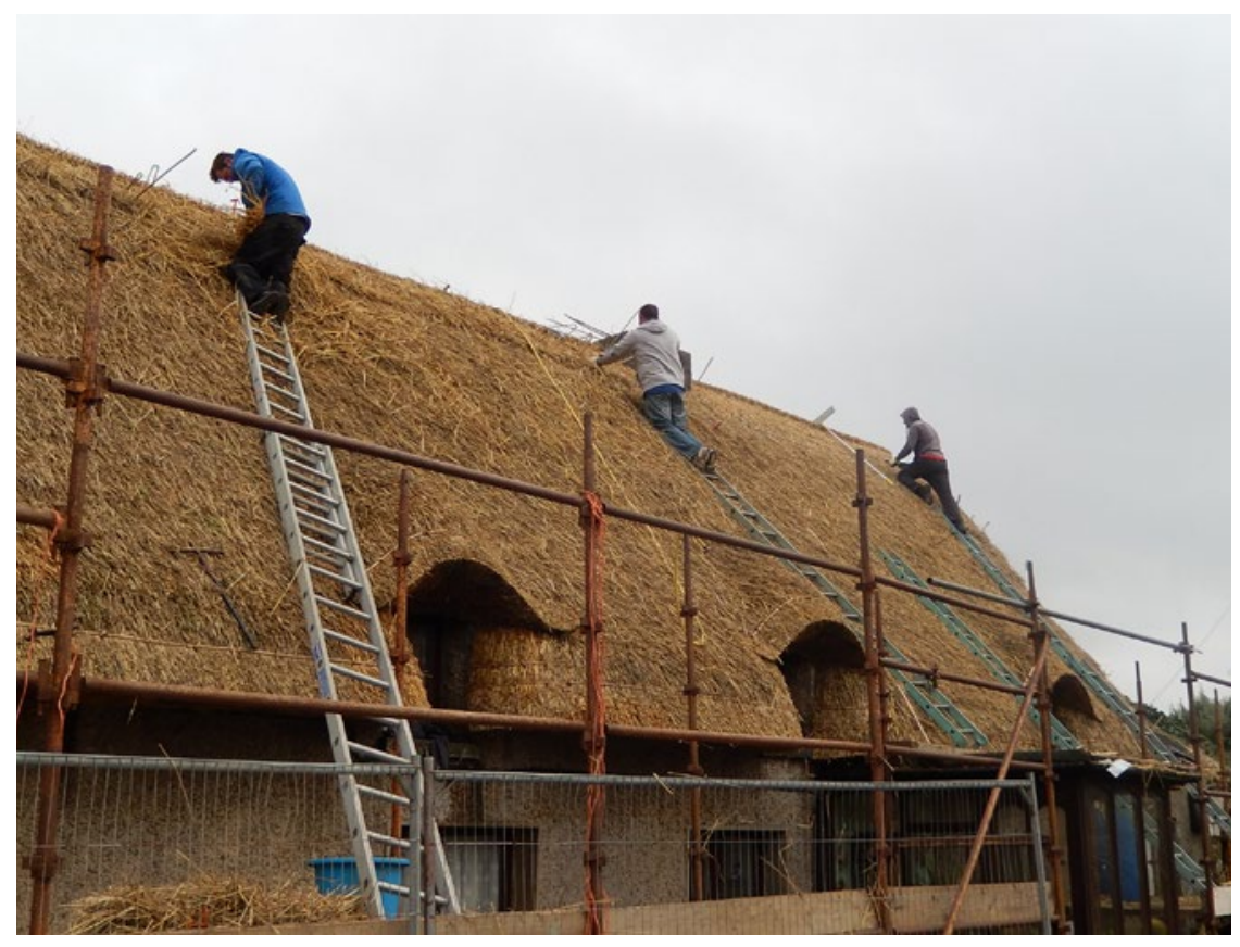
Grant repair of thatched roof Old Kilbush House, Rush

Council has a statutory duty to implement, fully supports the implementation of the Fingal Heritage Plan and has a range of specific objectives to support the protection and integration of heritage and green infrastructure in the planning process. The Plan ensures that the inherent value of our natural, cultural, archaeological and architectural heritage is protected and managed as part of the planning process.