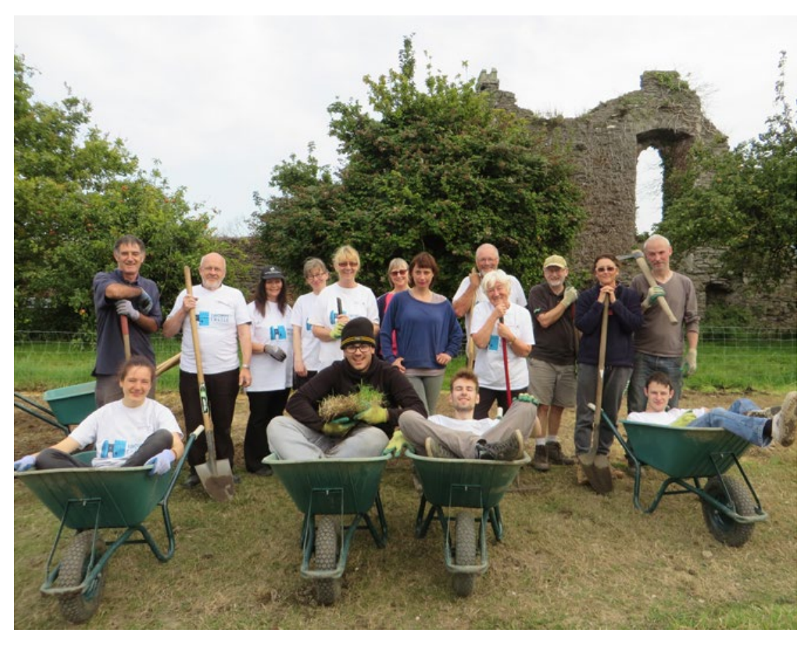
Archaeological dig at Swords Castle

and projects starting with Crínniú na Casca, which brought over 4,000 people to Swords Castle to celebrate creativity and culture in Fingal. The Creative Ireland Programme for Fingal showcased heritage projects such as the very successful Swords Castle Digging History , a community archaeology project which enabled local people to partake in an archaeological dig at Swords Castle.