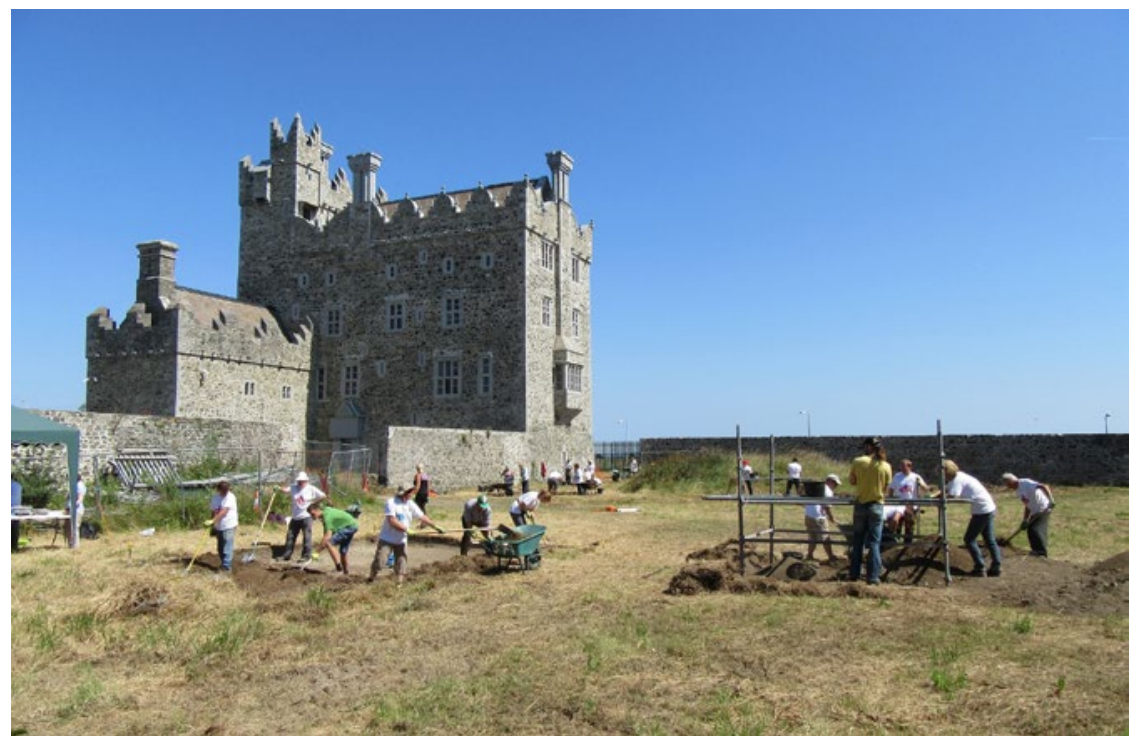
Bremore Castle Dig