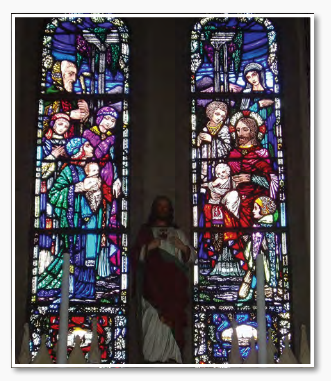
Harry Clarke - A Window on the Peninsula

Provision of enterprise training animation and capacity building support for underrepresented individuals and groups – funding available €90,000.