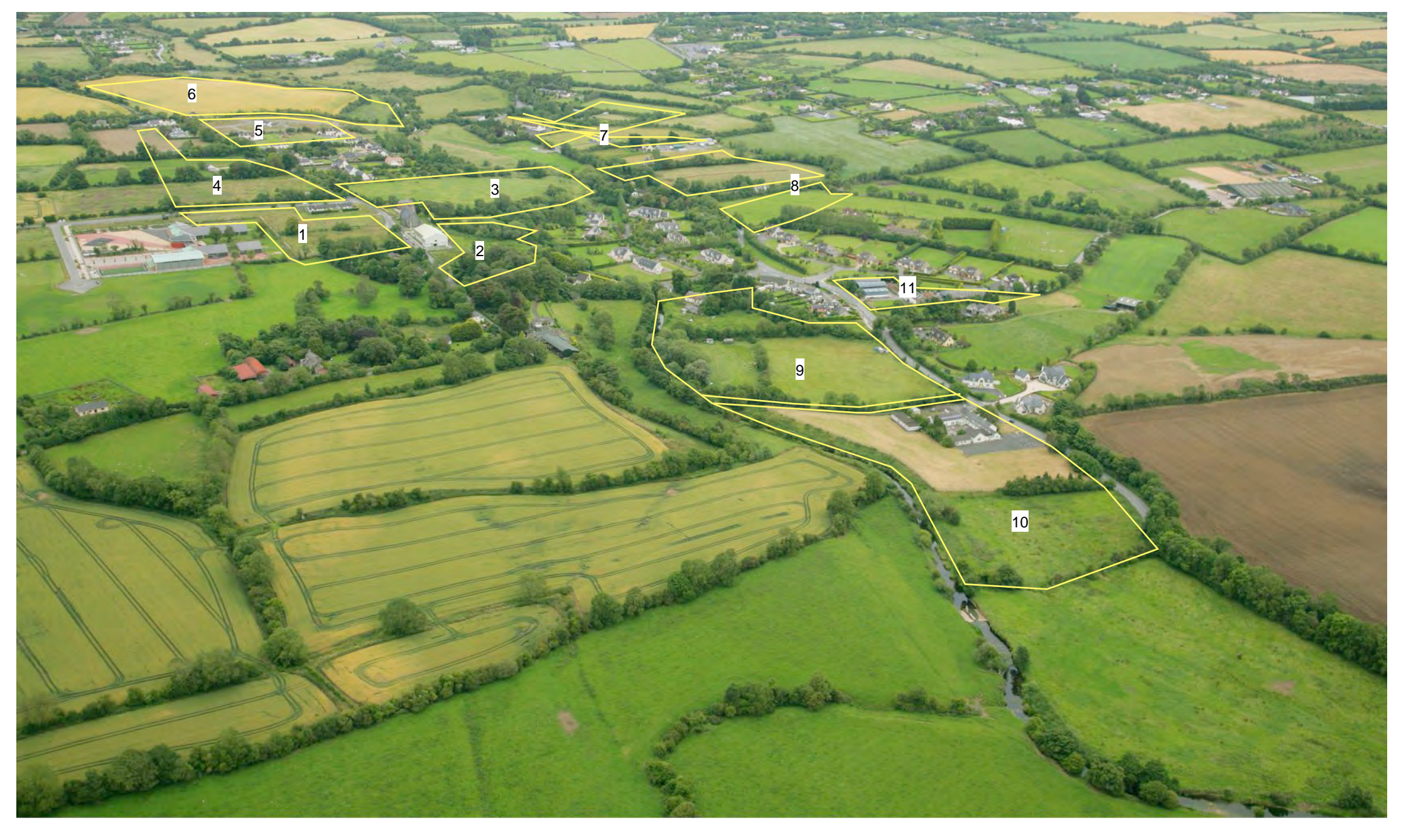
Aerial View of Rowlestown Village (2010), taken from NW showing approximate position of proposed Development Areas