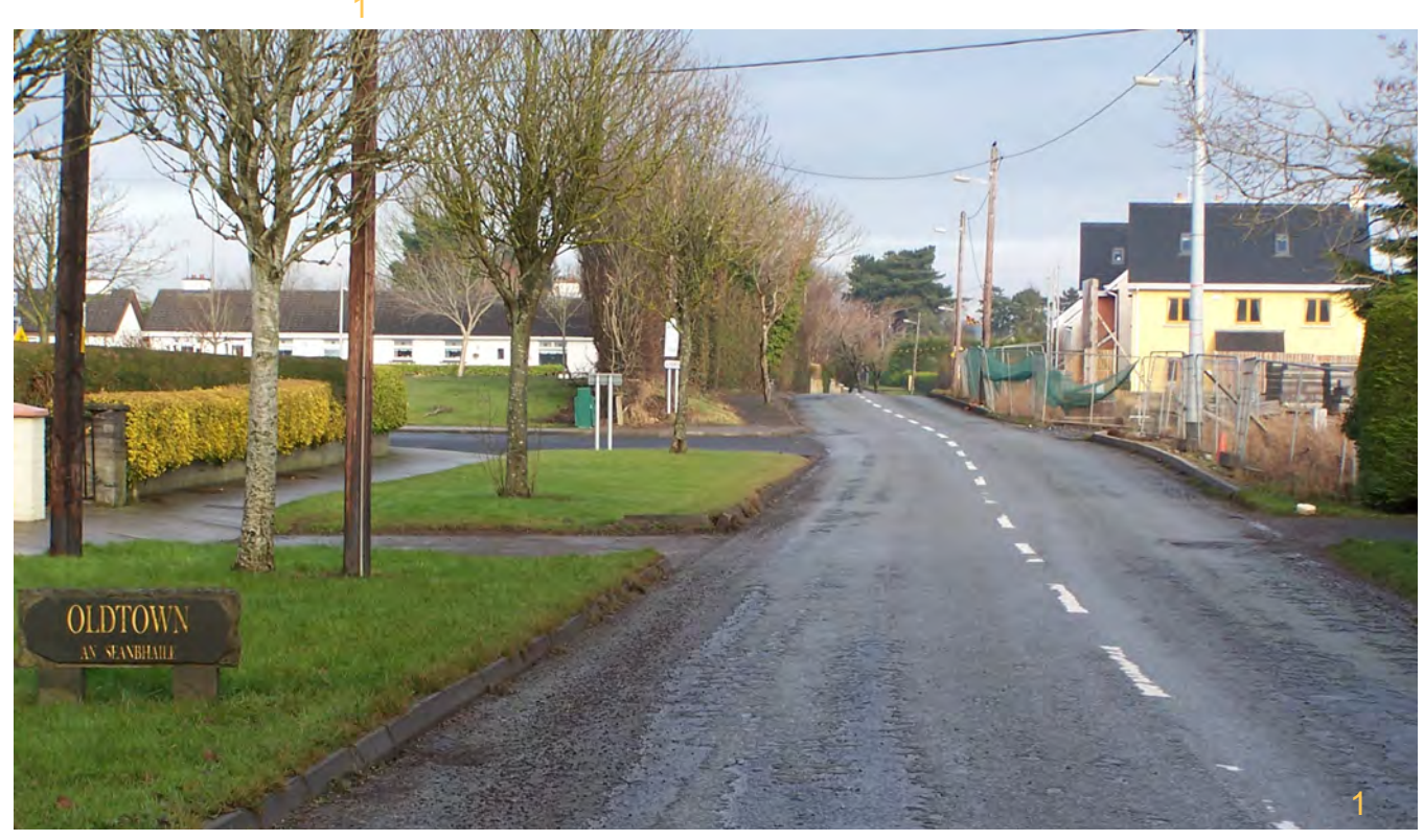
Above, 1: The straight road in from St Margaret's and Dublin is punctuated by the HSE Health Centre and these two housing developments. Shamrock Park on the left is from the 1970s and has generous open space. The boundary to the road is well-planted which acts as an effective visual and noise barrier. Weston Park on the right is unfinished and unsightly, in need of effective measures pending its completion. Below, left and right, 3 and 4: There is a tight turn to cross the bridge in the centre, an effective traffic calming measure which also 'announces' the heart of the old village. The recently re-thatched cottage beside the low two-storey stone house make an attractive pair.