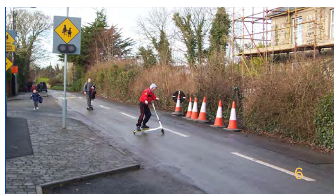
West Entry, from the Naul Road