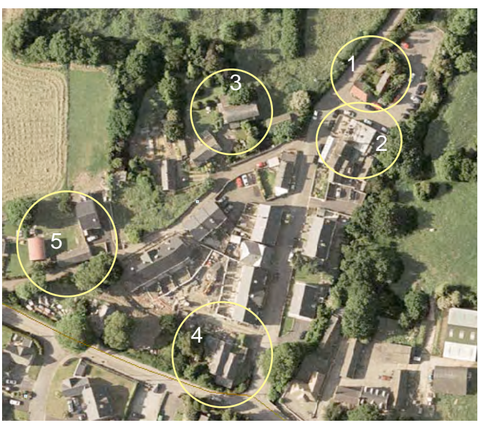
Above and below: Aerial view of the village centre and 1839 map, with buildings circled, which appear to be extant on the 1839 survey. Images 1 and 3 show Vernacular Inventory codes for reference. (Building No.5 on map is illustrated on p13. image no. 3). Buildings 2 and 4 are of architectural significance, classical style alongside vernacular buildings.