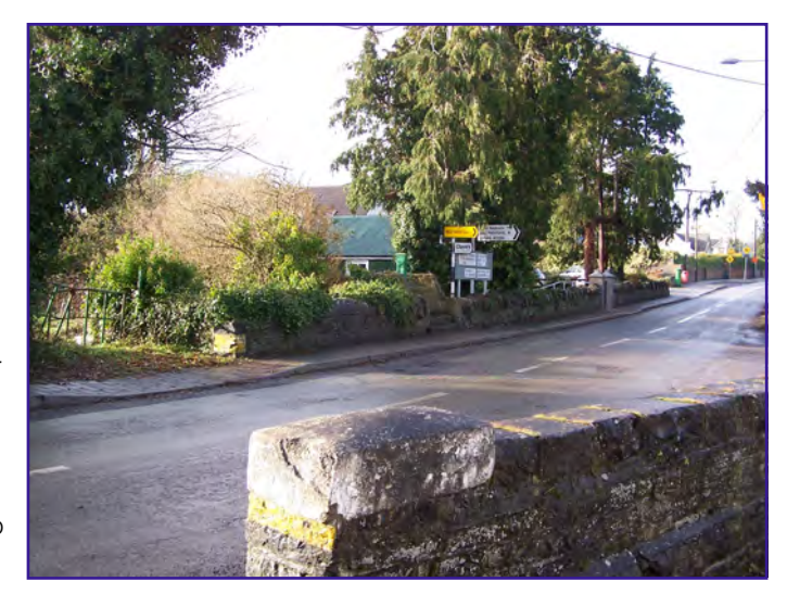
Above: The community centre is almost hidden in the trees which dominate this modest yet appealing structure. The River Daws travels under the road at this point, under the stone bridge. Right: The River is enclosed by wall and cutaway bedrock bank with overhanging trees. Below, Centre: Laneway runs parallel to river, leading into attractive meadow and cutaway edges to the river banks, labelled on the 1839 map as quarries. Below, left: Entrance to village centre from the South; a very satisfactory, Arcadian sense of arrival into the old village centre.

Oldtown village makes a quiet impact on the visitor, in an area of gentle landscape and mature hedgerows. The older areas of the village have, mainly, a canopy of trees overhead, whilst newer development has mainly created a more open landscape. The village is surrounded by orchards, which are very evident on the aerial views of the village context, but less apparent on the ground. The River Daws runs through the centre, buried in undergrowth, yet creating a corridor of nature biodiversity. The durable stone walls, boundary hedges and narrow lanes provide a distinctive character, adding to the impact of single storey vernacular architecture and some attractive stone built two storey houses.