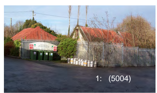
Key to numbers on maps and images: