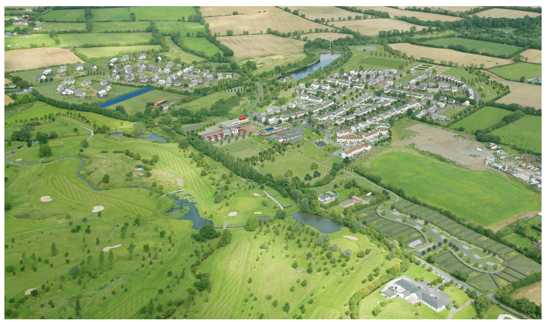
Village Development Framework Plan, showing proposals for all areas of Rivermeade Original Oblique Aerial Photograph taken 27 August 2010