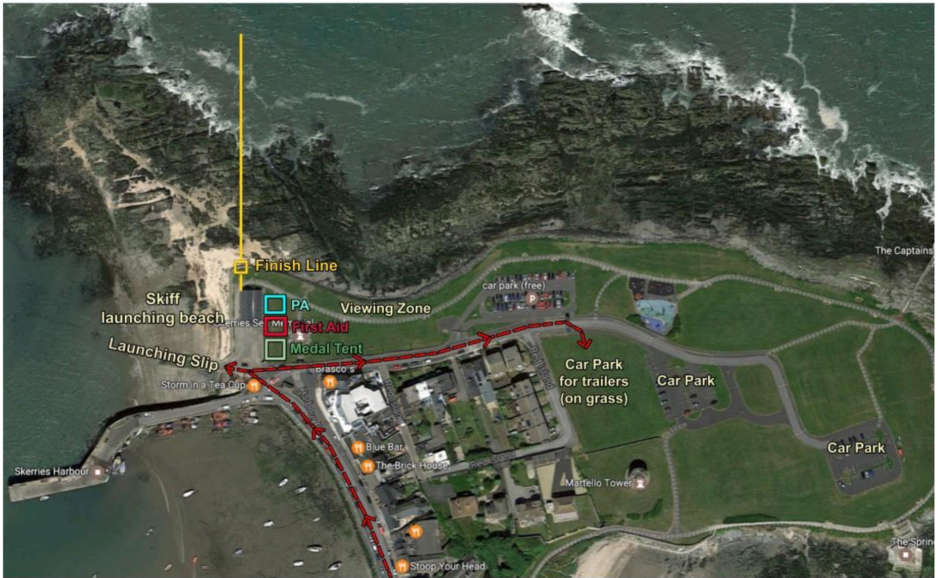
Skerries Rowing Regatta 2019 Organisational Layout