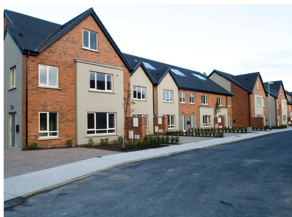
Social Housing acquired at Rossan Court, Dublin 15

During 2015 a total of 368 Social Housing units were delivered under a range of Housing Programmes including direct provision, Rental Accommodation Scheme, Long Term Leasing, Capital Assistance Scheme, Acquisitions and Pat V Acquisitions and the return of void properties during the period.