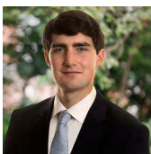
Jack Chambers Fianna Fáil