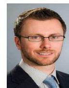
Roderic O'Gorman, Green Party