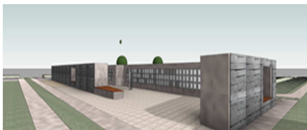
Balgriffin Cemetery Columbarium Walls