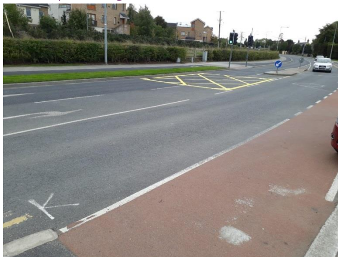
A new Yellow Box installed on the Porterstown Road

areas and will continue in the coming weeks, weather permitting.