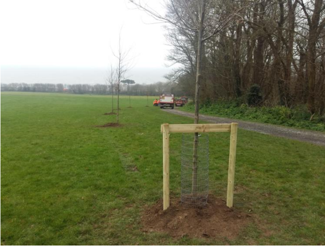
Footpath improvement works were recently completed in Santry Demesne.