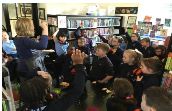
Children at Garristown Library enjoying a Cool Food School workshop