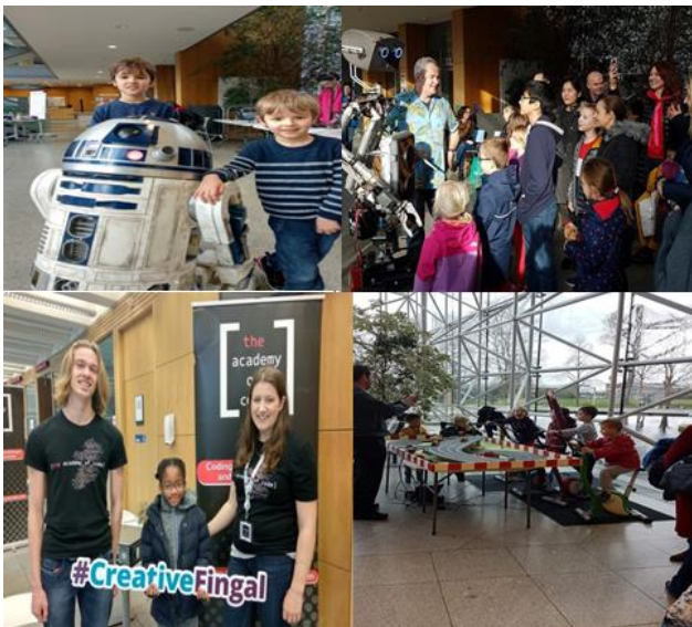
STEM Saturday at the atrium in Grove Road, Blanchardstown

Mechatrons, Ireland's leading creators in entertainment and educational robots, showcased robots from TV, film and computer gaming at the events. Participants took photos with their favourite robots and interacted with those that could talk and respond! The events also featured drop-in coding for all ages and a young engineers Lego workshop. These two events are a culmination of a year-long STEAM programme in Fingal libraries, which aims to enable everyone to have access to Science, Technology, Engineering, Arts and Maths in a fun way.