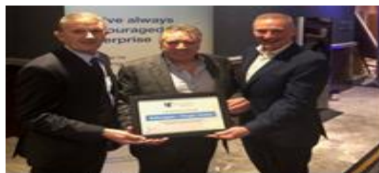
Balbriggan Chamber of Commerce received the Bank of Ireland Regional Runner-Up Award for the Dublin Region

The competition aims to promote enterprise by bringing business and community groups together in each town, and to showcase the spirit of enterprise in their local area. The competition is held in collaboration with local authorities.