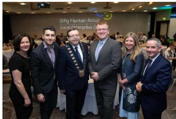
Speakers at the LEO Fingal major breakfast seminar in the Carlton Hotel, Dublin Airport on Wednesday 14th November

LEO Fingal hosted "Hire and Hold onto the Best Staff for Your Business", a breakfast seminar on best practice recruitment and retention policies for small businesses. The event took place in the Carlton Hotel, Dublin Airport on Wednesday 14th November with 80 companies in attendance.