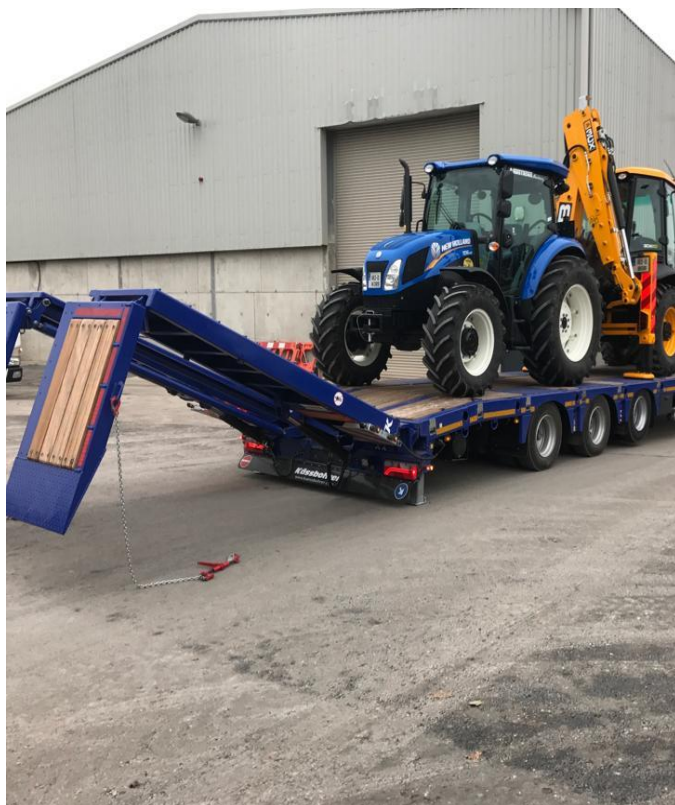
Transport of Vehicles for “Winter Ready” Launch at Saint Catherine’s Park, Lucan

These tenders are in the process of evaluation and award.